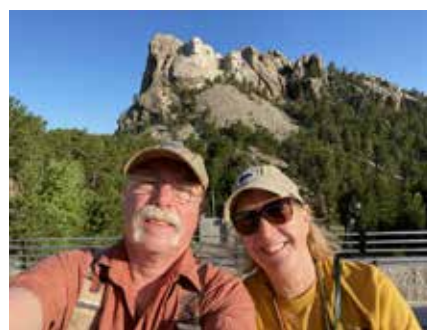
Above, top to bottom: Close enough for a reflection! Another great spot. Mt Rushmore in the background.