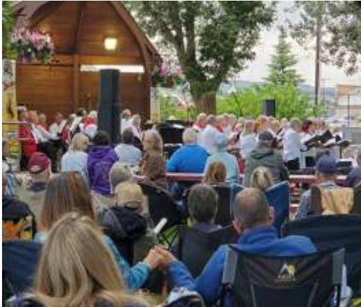
Airstream Band and Choir concert at Bunning Park in Rock City