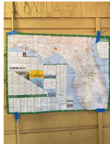
Where we all live...