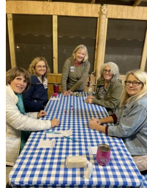
This weekend's games included LCR, Bunco, and Texas Hold-Em Poker, So FUN!