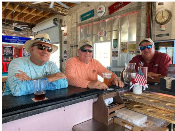
Wonder what they're up to now?