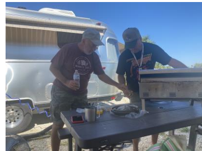
Getting tech advice