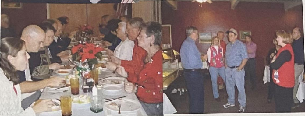
Having A Great Time at the January Rally