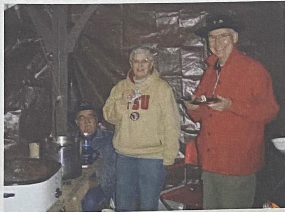
Fellowship at the January Rally