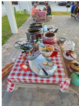
As usual, we all ate well!