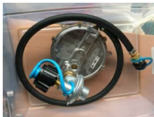
Close up of Hutch Mountain hoses and external propane regulator