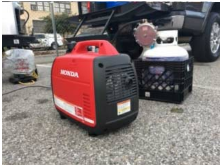
Honda EU2200i with Hutch Mountain propane conversion and adapter attached to external propane canister during Rose Parade Rally. With additional connections, it can be also be attached to the trailer's tanks.

Eventually, we chose a Honda conversion kit from Hutch Mountain, a highly-rated Utah-based company. https://www.hutchmountain.com/ Hutch Mountain offers two options: (1) they can supply you with all you need to do the conversion yourself on your self-purchased generator (there are many Utube videos of the process) or (2) they can sell you the conversion kit, facilitate the purchase of the generator through a local Utah company, have a local contractor professionally install the conversion kit for $60.00, and ship it to you, ready for use. We chose to have the kit installed on the Utah generator, and, although more pricey than the DIY option, it worked out great for us. Plus Hutch Mountain's customer service was fantastic. We later bought a quick disconnect set-up so we can run the generator with our Airstream propane tanks when desired.