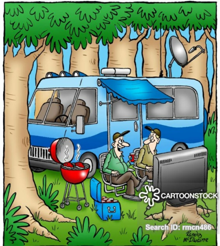
"There's nothing like roughing it in the woods to make a man feel alive!"