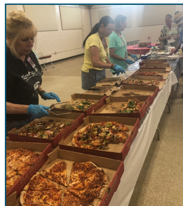
Pizza, pizza, pizza served by our fantastic Region 5 volunteers