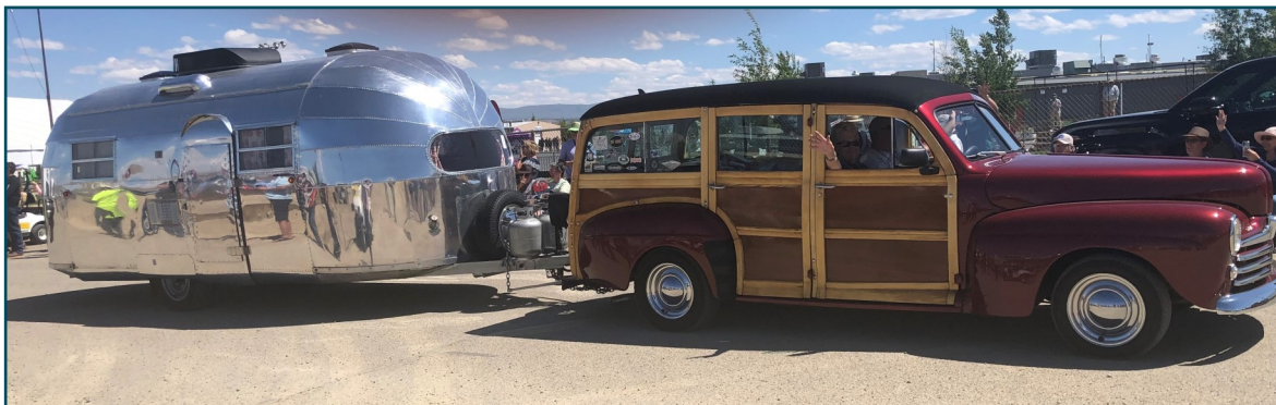
A highlight of the Vintage Parade at the International Rally

May 15th – 19th, 2024 Mark Twain Cave Campground 300 Cave Hollow Road Hannibal, Missouri 63401 More Info to Follow~