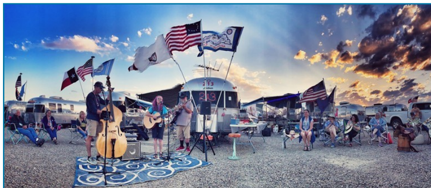
Happy Hour at International with talent from Region 5;