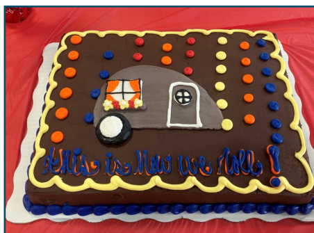
“It’s How We Roll”