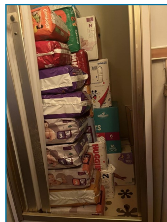
Donated diapers surround the stove (left) and fill the shower (above). Who needs a shower anyway??