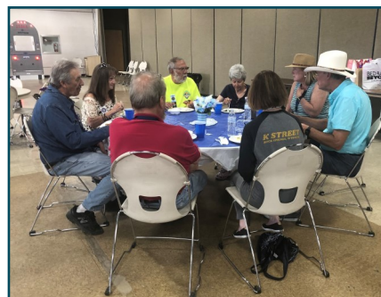
Region 5 members enjoying delicious food and fantastic friends