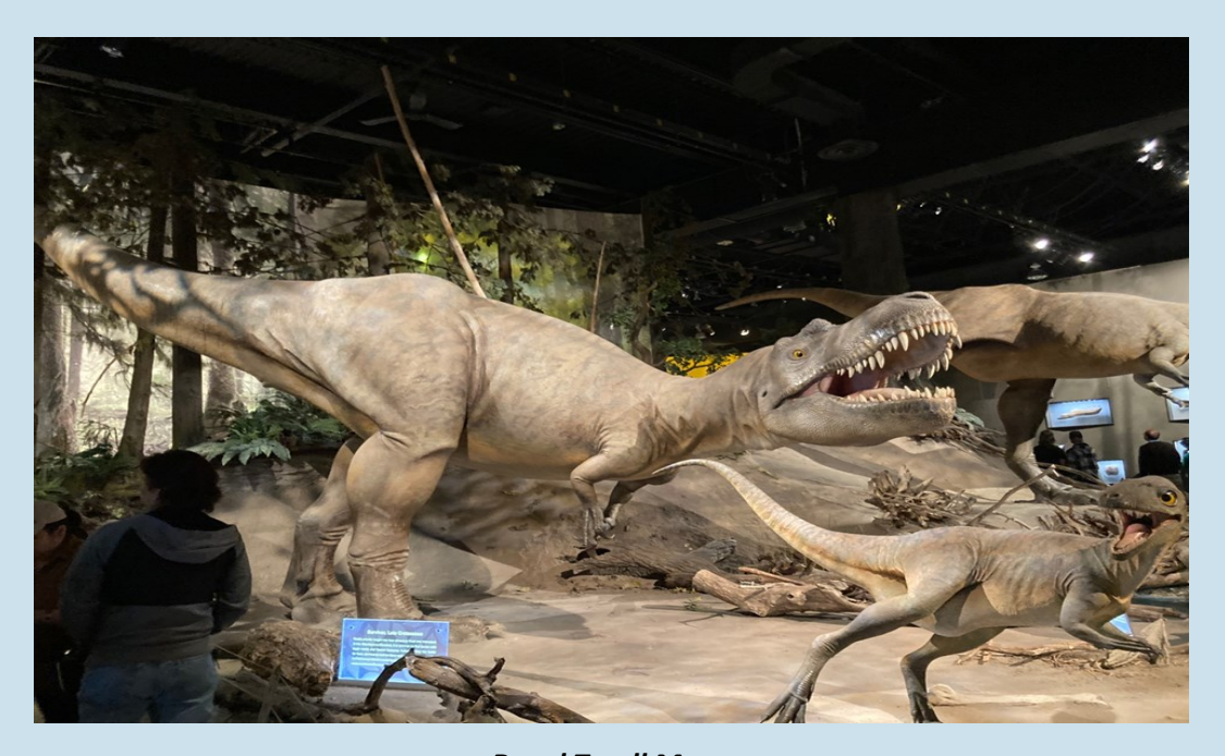
Royal Tyrell Museum

Our travels began in Drumheller, Alberta, a place famous for its Royal Tyrell Dinosaur Museum. Lots of fossils have been found in the area, and the museum was unique- including a docent-led nature walk.