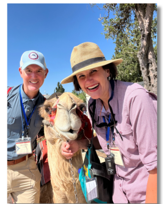
Selfie with an unnamed camel in Jerusalem

Morris and I have not been traveling in our Airstream lately. We took some time to travel by air for 71 days to 6 different counties (which included Israel, Italy, Turkey, Greece, Germany and Finland - where the interesting pig-duck statue lives, see photo). We saw so many historical sites and art. Each country had its own unique delicious cuisine. Most of all we enjoyed making new friends and seeing old friends and family as well. It's a long time to be away from our trailer and we look forward to more time on our beloved Airstream. ~ Muffin Camp