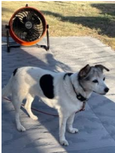
I keep cool with my own fan.

The next day the music festival kicked off, and my folks did it all. Unfortunately for me, most of the places did not indulge 4 leggers, but I was quite content to hang out in my "Silver Kennel" in the uber-cold A/C and listen to Marfa Public Radio. Highly recommended!