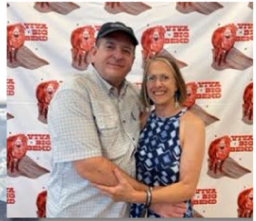
My humans occasionally bring me back a "doggie bag".

Headed home to the "Surface of the Sun". And, yes it was hot in West Texas, but about 10 degrees cooler than San Antonio. Would go again in a heartbeat! Gas up the truck, Dad!