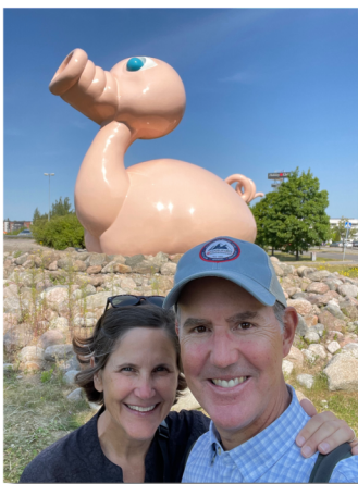
Posankka in Turku, Finland

Morris and I have not been traveling in our Airstream lately. We took some time to travel by air for 71 days to 6 different counties (which included Israel, Italy, Turkey, Greece, Germany and Finland - where the interesting pig-duck statue lives, see photo). We saw so many historical sites and art. Each country had its own unique delicious cuisine. Most of all we enjoyed making new friends and seeing old friends and family as well. It's a long time to be away from our trailer and we look forward to more time on our beloved Airstream. ~ Muffin Camp