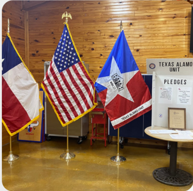
Rich Espinosa did an excellent job displaying the flags