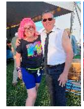
The Pinkmans Dressed for the 80s