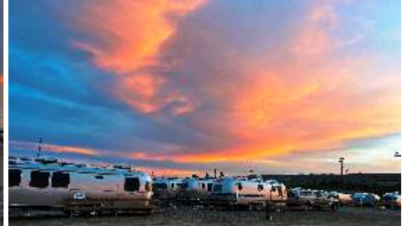
Sunset Over the Airstreams