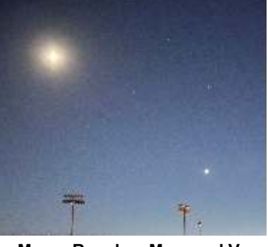
The Moon, Regulus, Mars and Venus

The wind was blowing, but it felt so good to set up and get ready to relax, explore, learn and share. The alignment of the moon, Regulus, Mars and Venus was amazing!