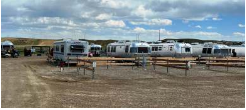
Our Parking Corrals

Put this experience on your bucket list!!