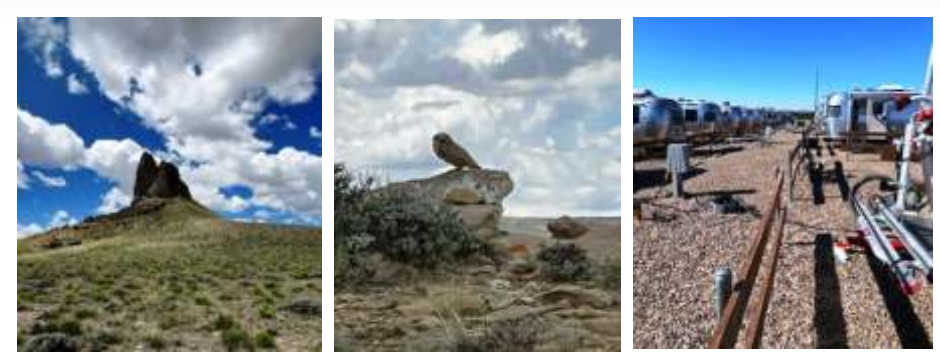
Boar's Tusk Rock (Namesake of our RV Park)

We were so impressed with all the planning, events and community. Enjoyed exploring the Rock Springs area to boot!