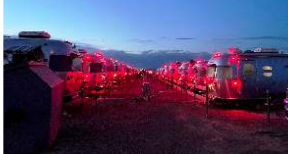
Airstreams Aglow at International!