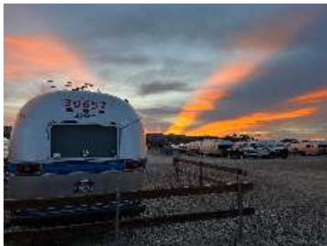
Amazing Sunset Streaks!