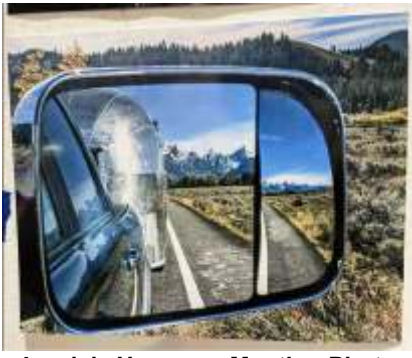
Lorrie's Honorary Mention Photo