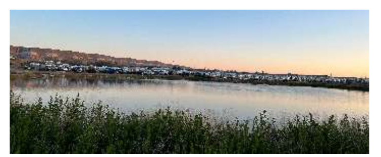
The Boars Tusk Pond Surrounded by Silver