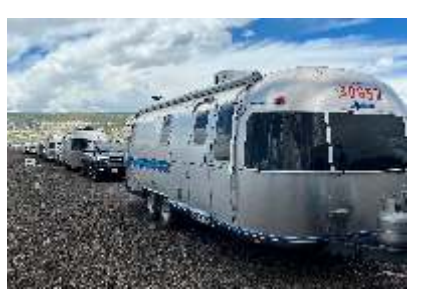
Waiting . . and Waiting . . and Waiting for Our Turn to Park

The wind was blowing, but it felt so good to set up and get ready to relax, explore, learn and share. The alignment of the moon, Regulus, Mars and Venus was amazing!