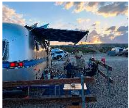
Relaxing After Happy Hour