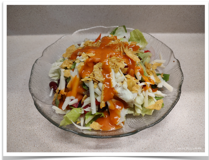
The Crowd Pleasing Taco Salad

[a great use for all the broken bits always left in the bottom of the bag]