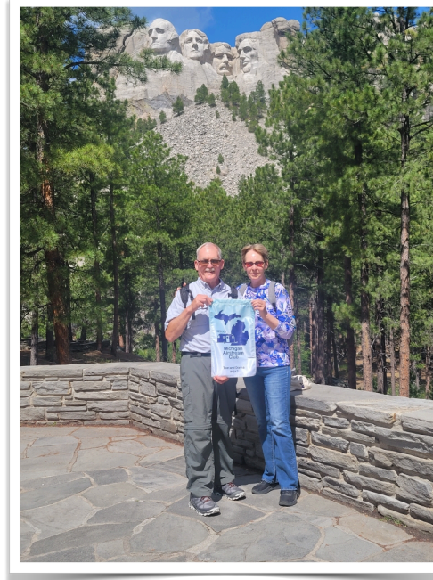
Showing off the MAC flag at Mt. Rushmore