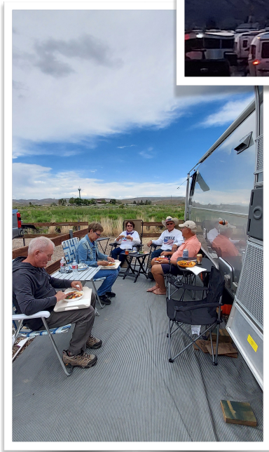
MAC Sharing Meals Together