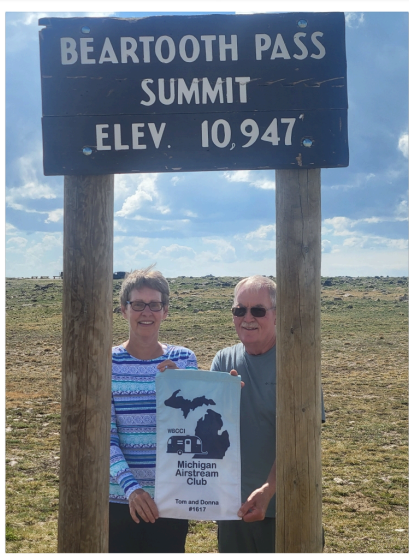
Beartooth Pass, Wyoming