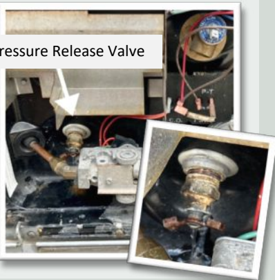
Pressure Release Valve

After the tank is drained, give the opening threads a good clean with the short wire brush.