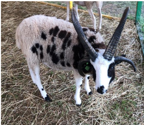
Strange goat? Not quite. A four-horned Jacob's sheep at the Otsego, NY county fair.