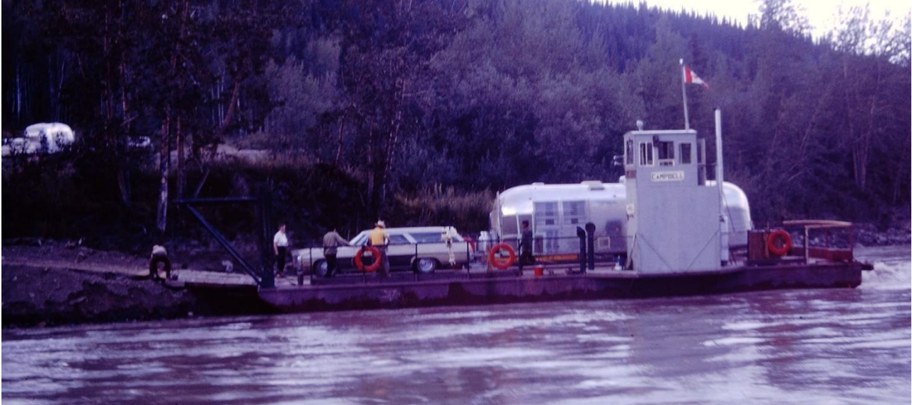
On the 1968 Alaska Caravan an Airstream rides a ferry to get to the other side.

included. I found the planned activities all very nice and varied. Each area of Alaska has been unique, the beginning of the trip it was drier and was located in the gold rush areas. We then traveled to Denali which is a National Park so a bit more rural. Denali requires some pre-planning: there is a popular National Park Service bus tour that requires advance reservations and fills up quickly. Wildlife is plentiful in the park. We saw grizzly bears, sheep, and moose. We also were lucky enough to actually see Denali the mountain the park is named for as it is often shrouded in fog and clouds. It was spectacular. We also spent time on the coast and in Kenai where glaciers are abundant and fishing is a way of life. Then on to Homer and Valdez which are rainforest areas so a wetter and absolutely beautiful. We have not yet completed our journey, the caravan ends September 13 and we will then travel home.