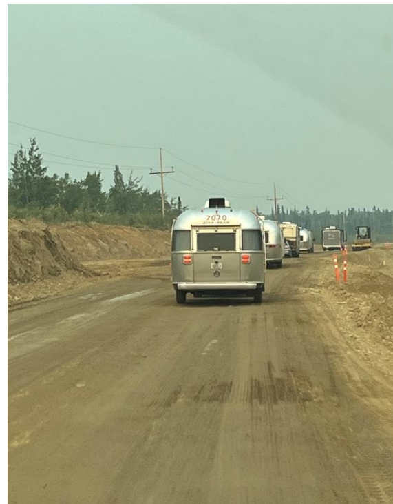
Dirt portion of the Alaska Highway.

The caravan begins in Dawson Creek, Yukon in early July. For those of us in New Jersey it takes some