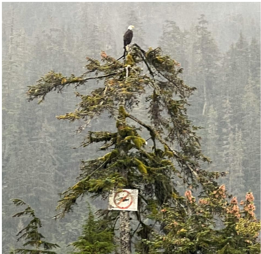
Bald eagle about to ignore the No Fishing sign.

included. I found the planned activities all very nice and varied. Each area of Alaska has been unique, the beginning of the trip it was drier and was located in the gold rush areas. We then traveled to Denali which is a National Park so a bit more rural. Denali requires some pre-planning: there is a popular National Park Service bus tour that requires advance reservations and fills up quickly. Wildlife is plentiful in the park. We saw grizzly bears, sheep, and moose. We also were lucky enough to actually see Denali the mountain the park is named for as it is often shrouded in fog and clouds. It was spectacular. We also spent time on the coast and in Kenai where glaciers are abundant and fishing is a way of life. Then on to Homer and Valdez which are rainforest areas so a wetter and absolutely beautiful. We have not yet completed our journey, the caravan ends September 13 and we will then travel home.