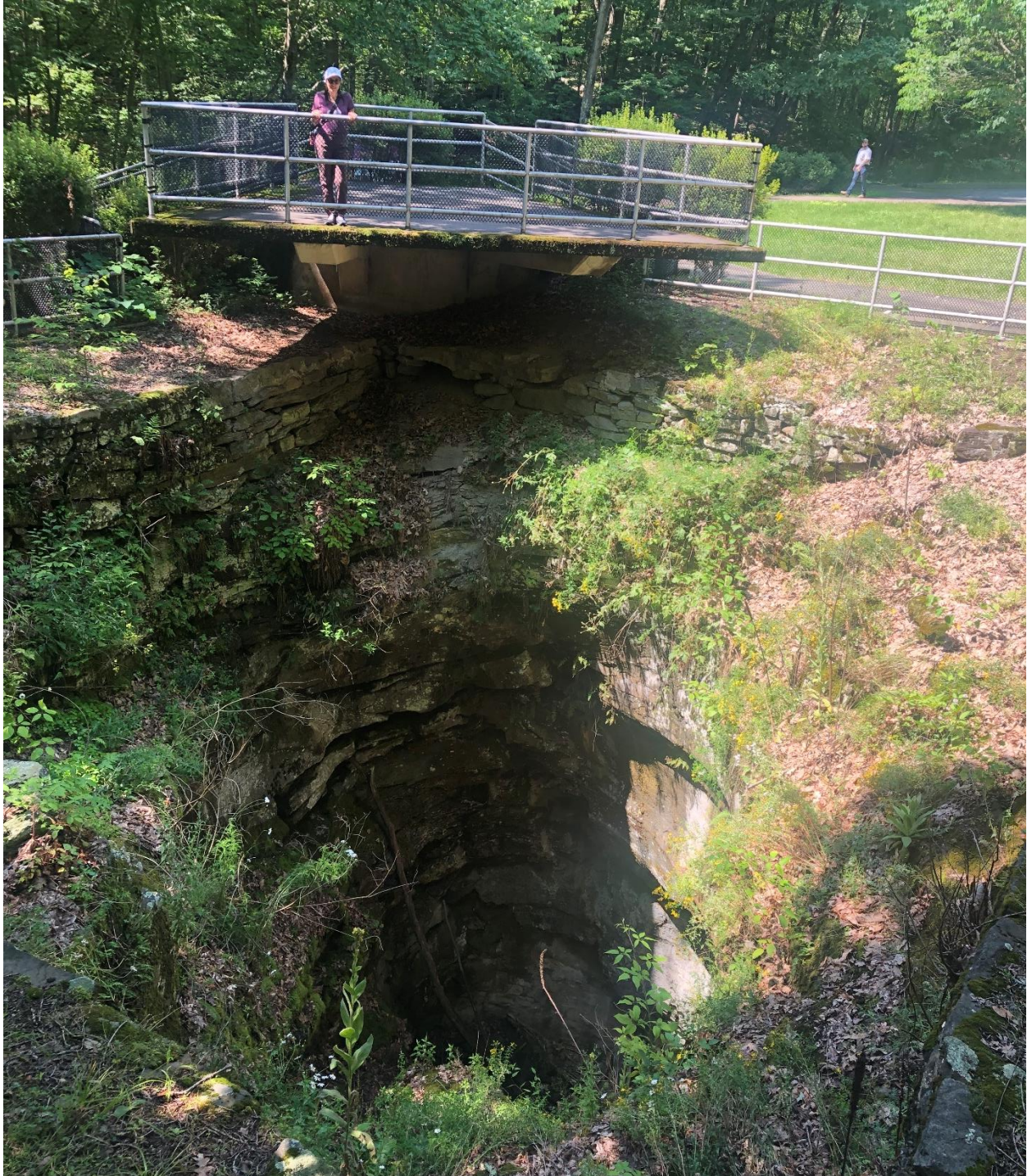
Lois Wagner studies the 38-foot deep pothole in Archbald Pothole State Park near Scranton, PA. Discovered in 1884 by coal miners when the roof of a mine tunnel caved in, revealing the pothole above, the pothole was created by a huge vortex of glacial meltwater scouring the bedrock below a retreating glacier about 10,000 years ago.