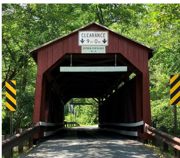
One of the covered bridges we had to avoid on our way to the campground.