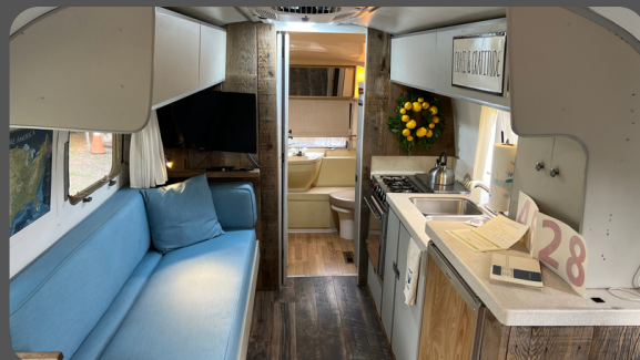
1969 Safari 22ft. = $32,000 | Call (336) 596-7514