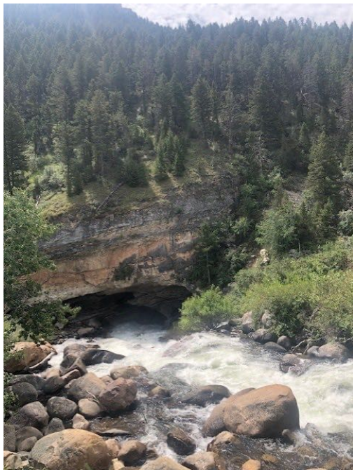
Sinks Park in Lander, WY