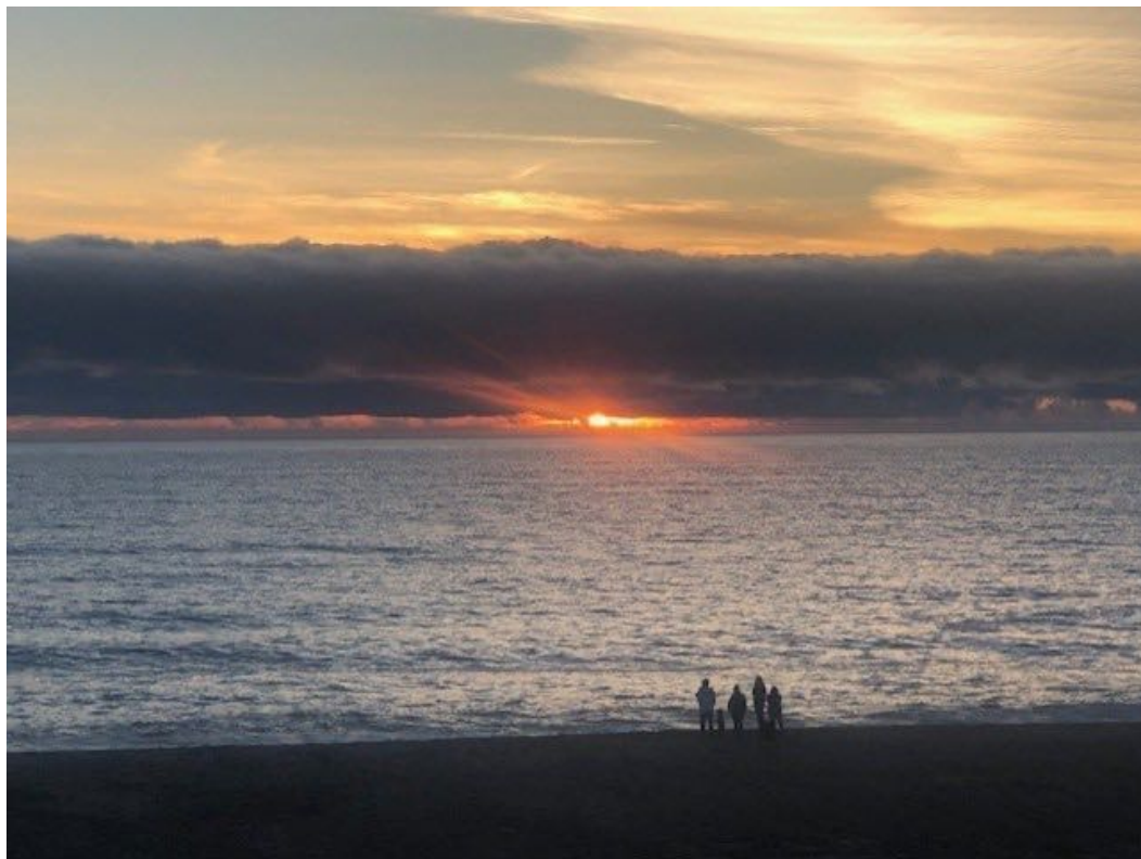
Sunset on Depoe Bay, OR