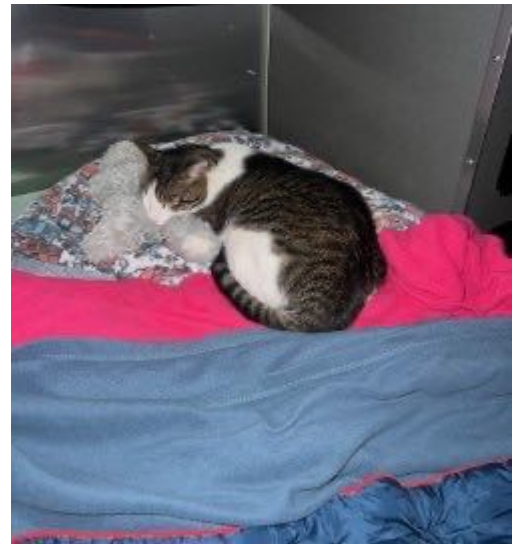
Travel Cat: Lucky

If you drive from Amarillo into New Mexico on I-40, Santa Rosa is 170 miles. It's a pleasant, high desert setting. The campground has some electric sites, restrooms with showers, and even wi-fi hotspots (that sometimes work). There is a trail that circles the entire lake, with boating and fishing activities as well.