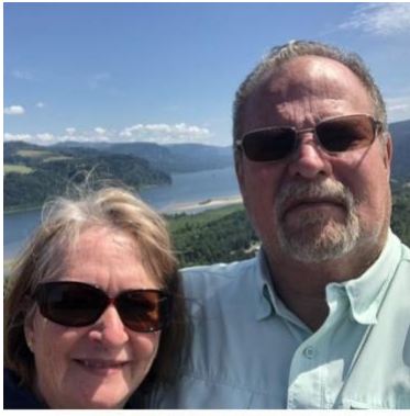
CAC Affiliate Members