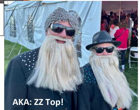
AKA: ZZ Top!