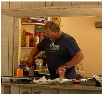
Winging it: Sausage-cooker-extraordinaire hard at work!