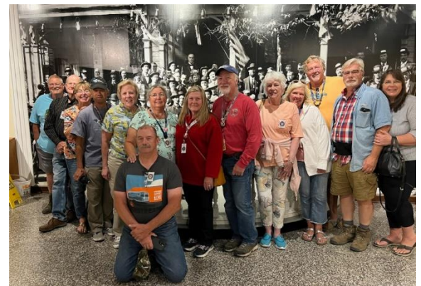
AOAC at McKinley Presidential Library...