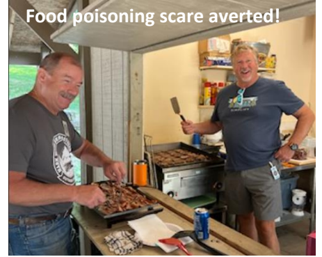
Food poisoning scare averted!