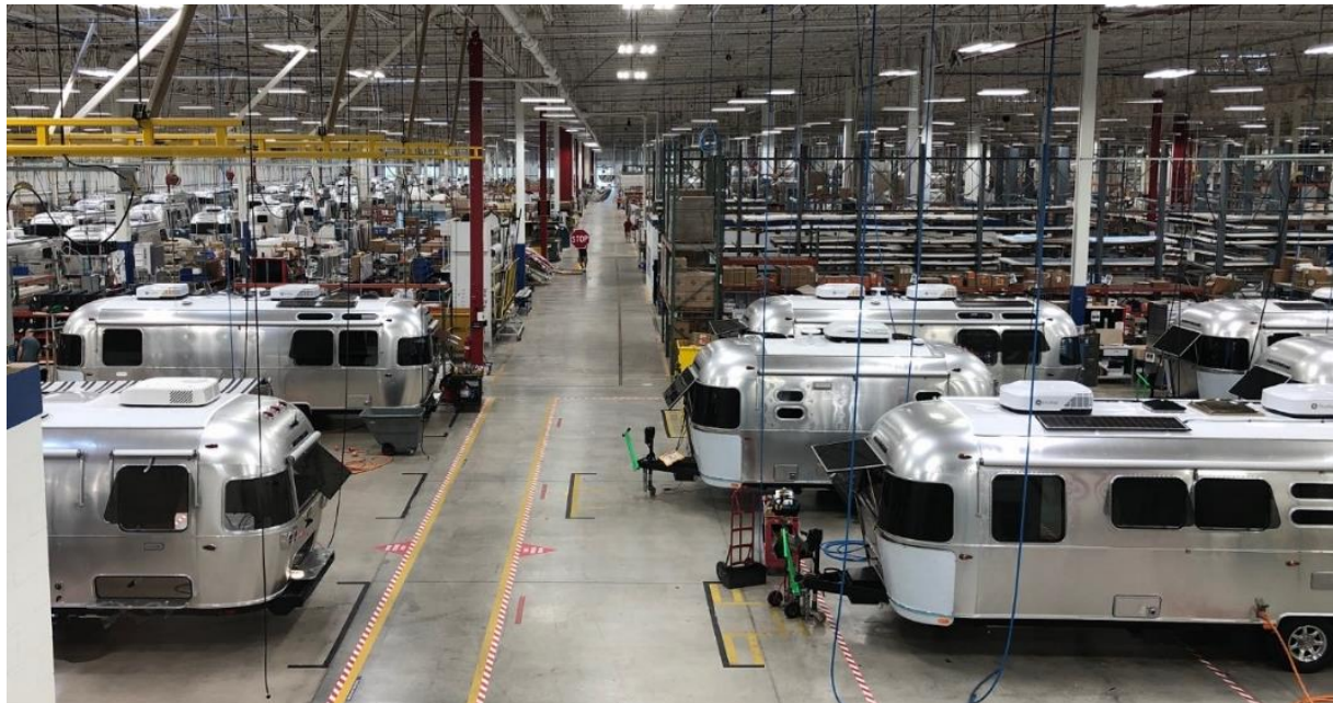
View of the new factory floor from the observation deck at the Heritage Center. Airstream travel trailer assembly starts far to the right with the building of the outer shell, attaching it to the frame, laying in the floor, wiring, and plumbing followed by the inner skin. From there the shells are tested for leaks with 10,000 gallons of water sprayed at 80 miles per hour for twenty minutes. At the point shown above the completed shells then make a 90-degree turn to the right for installation of the interiors.

into two sections: one offered 3-amp per trailer power to keep the batteries charged, the other was for campers who wanted to run generators. About 2/3rds of the campers elected to go with batteries only. Derek and Lois camped in the generator area as Derek isn't happy without his toast in the morning. Water hookups were available to everyone. Six VIPs shared the