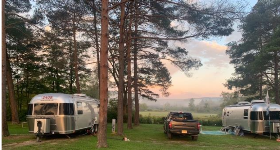
Evening at Pine Creek Campground, Newfield, NY.