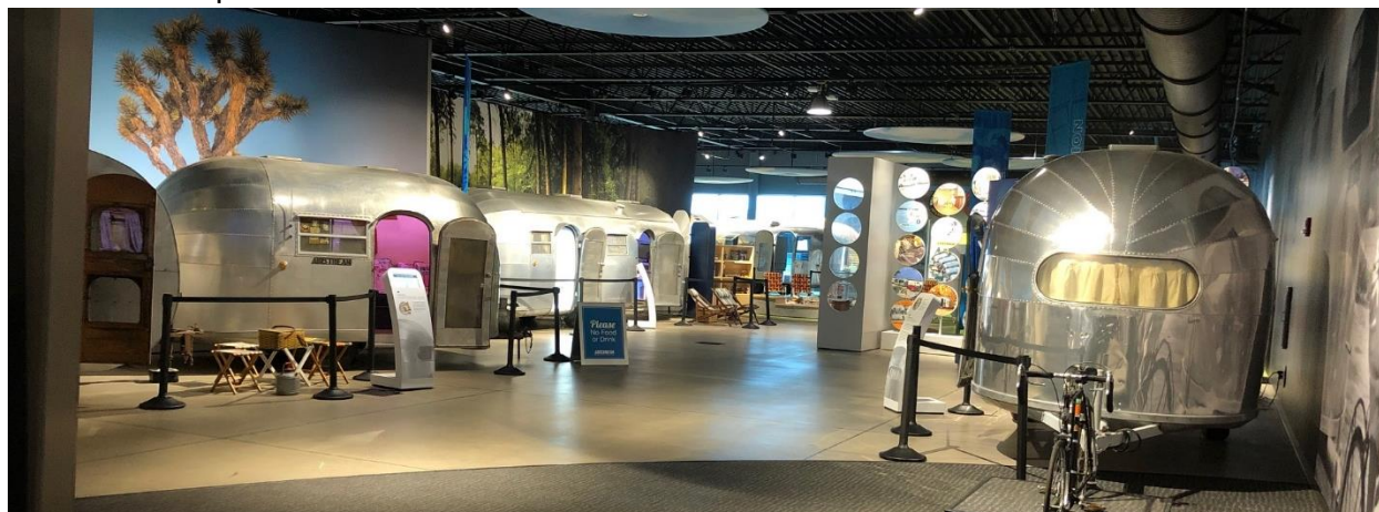
A portion of the Heritage Center.

The Heritage Center, which is located in the new factory, is a first-rate museum that explores the history of Airstream and its products through exhibits, movies, and narratives. Did you know that in the 70s Airstream made a version of its motorhome as a funeral coach, family ensconced on plush dark-velvet settees and armchairs in the front and the decedent's casket in