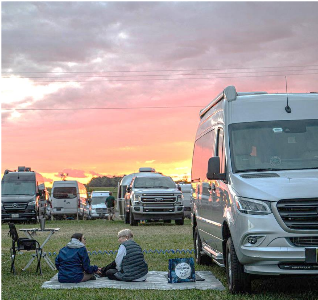
Lois Wagner and Lynda Kresge take in a western Ohio sunset next to Lynda's Interstate "Miss Lolly".