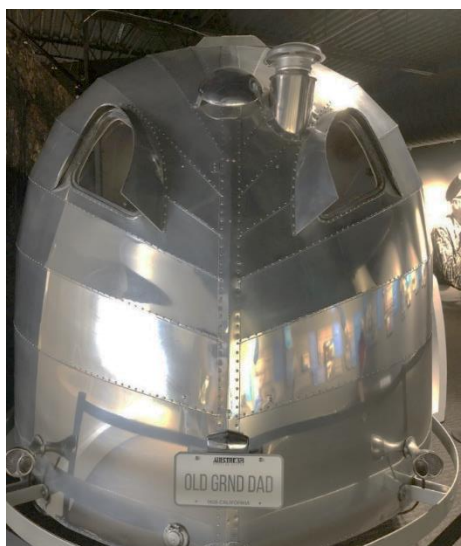
Rear view of Old Grandad, one of the first Airstream trailers built in 1931. Note the deep "eyebrows" on three sides of each window, the circular roof vent and the chimney for the wood stove.

Terraport, the hexagonal full-service docking station normally used by campers who have brought their rigs in for while-they-wait service.