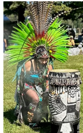
Seneca Indian Pow-wow, Seneca Nation.