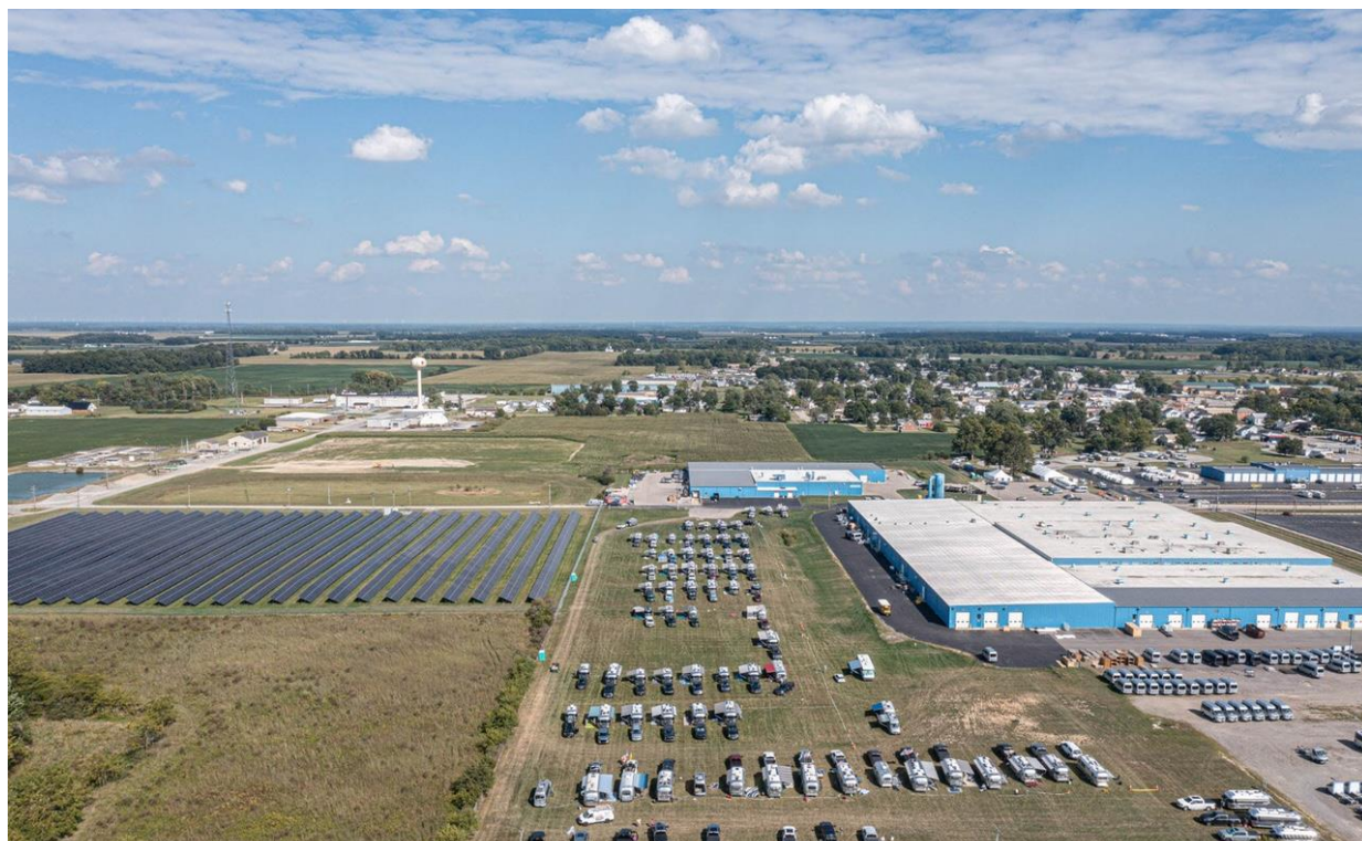
Rigs attending Alumapalooza parked in the field next to the original factory.