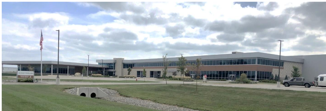
The new factory, about a mile west of town, is where all the travel trailers, save the Basecamp, are built. RVs and Base Camps are built at the original factory. The new factory includes the Heritage Center (far left portion of the building).