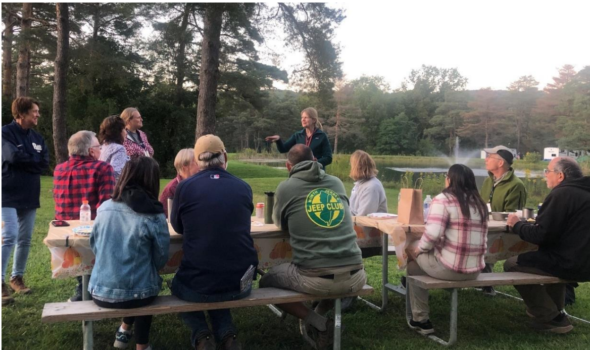
The after-dinner raffle. Good prize or Bad prize?