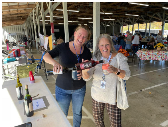
Having fun at wine tasting!

Saturday morning provided more informational classes and the afternoon was filled with a craft fair, flea market, bourbon trail, beer swap, and wine tasting.