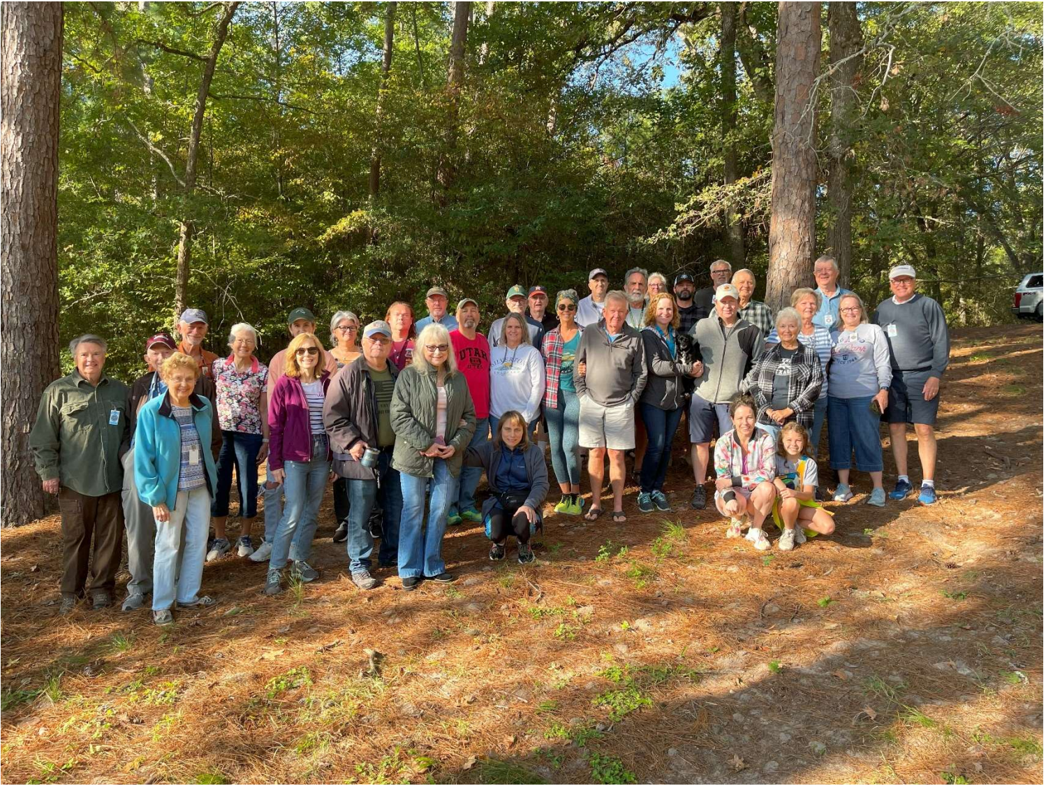
Group photo after breakfast!