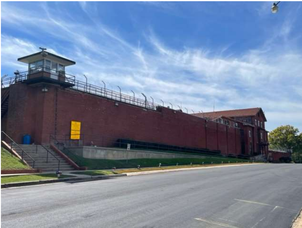
The “Walls Unit” 815 12 th St, Huntsville, TX

Saturday afternoon, we visited the Texas Prison Museum which was opened in 1849 and is the oldest Texas State Prison. During the Civil War, Inmates produced tents and uniforms for Confederate forces. The red brick walls of the prison led to the nickname of the “Walls Unit”. The artifacts in the museum detail the history of the prison system as well as some notable inmates such as Clyde Barrow of Bonnie and Clyde fame, John Wesley Hardin, and Karla Faye Tucker. It’s an interesting place to visit but you wouldn’t want to live there.