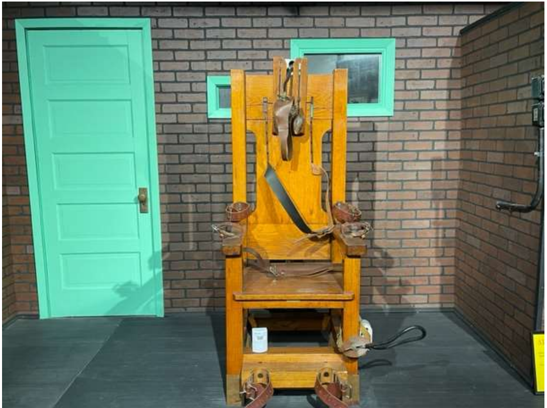
“Old Sparky” in use from 1924-1964