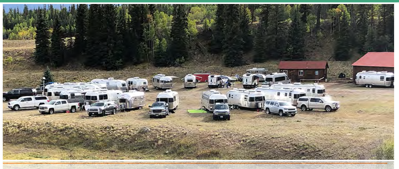
Circle the Wagons Rally in Creede, Colorado!