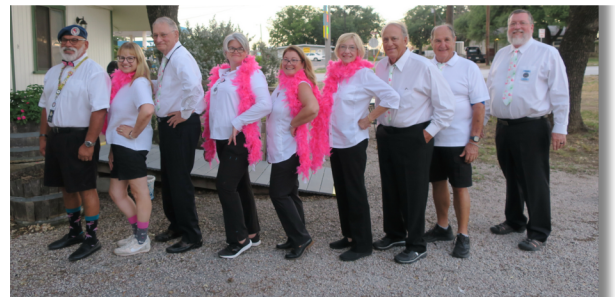
Our new board members