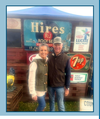
Club Facebook Page: <u>Central Indiana</u> <u>Airstream Club</u>