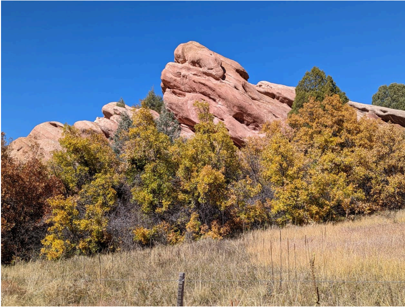
Deer Creek Canyon

The following day Travis was excited about doing some 4 wheeling out in the mountains with my FJ Cruiser (tow vehicle), so we drove west just past Idaho Springs and then from paved to gravel to dirt to seriously rugged singletrack up toward Loch Lomond. Out in the middle of nowhere, then a precarious triple K-turn to be ready to head back down. Parked safely and then we were off hiking on the trail up to the Loch with once again amazing views; had a few snowflakes on the 3-mile hike, again at above 11,000 FASL. We traversed safely back to paved roads and to the campsite to grill some burgers and taters along with a veggie or two, beverages and then a nice campfire as the stars came out.