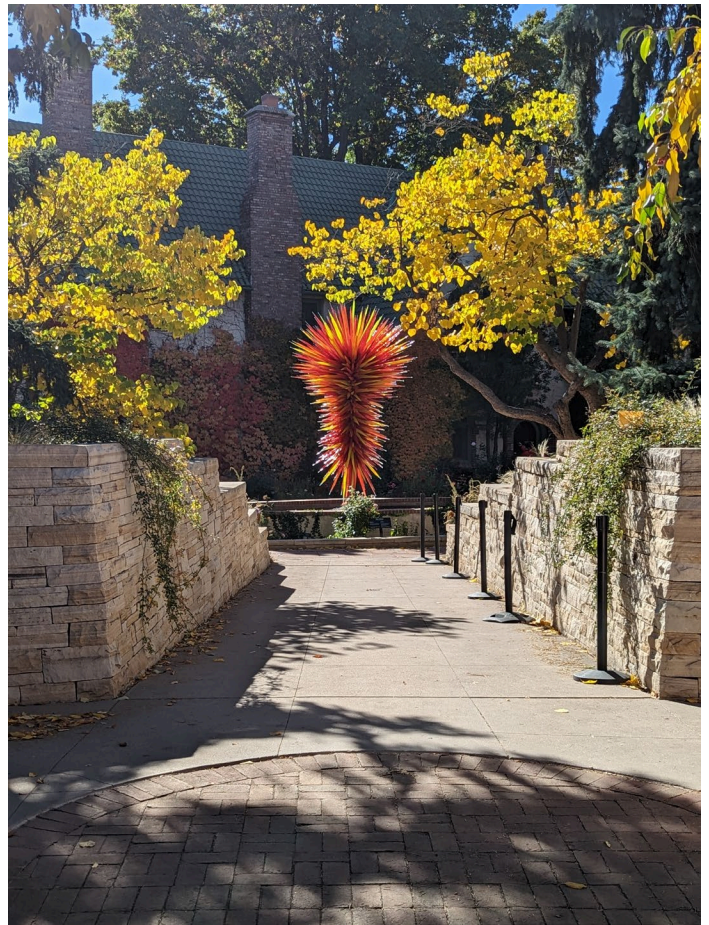
Denver Botanical Gardens