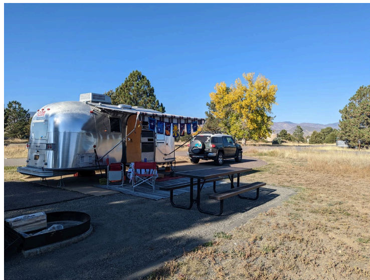
Chatfield State Park

The next day I squared away the Globetrotter and headed south 1 ½ hours to Chatfield SP, adjacent to the huge Chatfield Reservoir. I was now SW of Denver about 30 minutes, again adjacent to the Rocky Mountain's foothills where I had previously booked a 10 day stay. Like at the Horsetooth Campground, I opted for electric sites knowing the temps certainly dip at night, and my little ceramic heater would do the trick. (Most all campgrounds on the Front Range terminate campsite water hook-ups by early September.) At both campgrounds I was able to fill my fresh tank at a common spigot, then dump on the way to the next to reduce my tongue weight, as my fresh tank is located at the front of my Airstream.