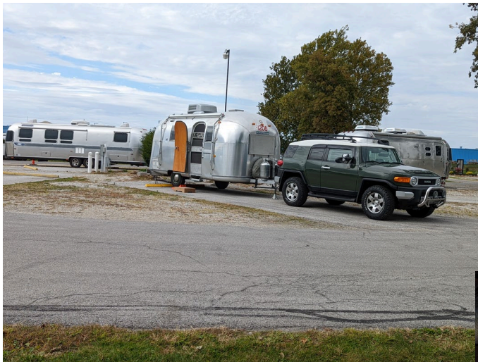
Jackson Center Campground