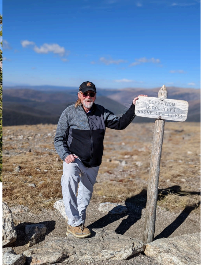
Top of the Park

The next day I squared away the Globetrotter and headed south 1 ½ hours to Chatfield SP, adjacent to the huge Chatfield Reservoir. I was now SW of Denver about 30 minutes, again adjacent to the Rocky Mountain's foothills where I had previously booked a 10 day stay. Like at the Horsetooth Campground, I opted for electric sites knowing the temps certainly dip at night, and my little ceramic heater would do the trick. (Most all campgrounds on the Front Range terminate campsite water hook-ups by early September.) At both campgrounds I was able to fill my fresh tank at a common spigot, then dump on the way to the next to reduce my tongue weight, as my fresh tank is located at the front of my Airstream.