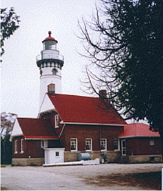
Seul Choix Point Lighthouse

The first two evenings of the trip we all met in the campground's conference building with a fireplace blazing, dinner provided, and followed a pattern of changing tables to meet two or three other couples. For 20 minutes each time we talked about ourselves in relation to a suggested topic, like favorite hobbies or camping trips. By the third day, we felt we knew everybody and were comfortable camping or eating next to others in the caravan. Also, the first night, every couple had their picture taken and the next day we had a printout of pictures with names underneath.