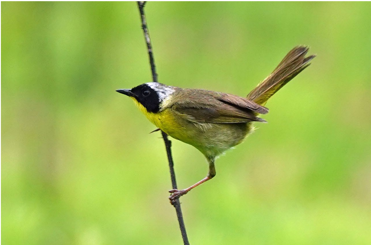
Common Yellowthroat at the Natural Lands Crows Nest Preserve

Of note, Natural Lands is an organization similar to the Nature Conservancy. They are taking over large tracts of land in southeastern Pennsylvania and preserving them as ecologically important areas. We hiked their Crows Nest Preserve tract, very nice, especially for us birders.