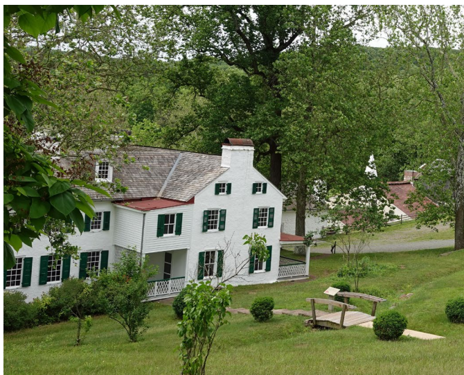
The Owner's Home