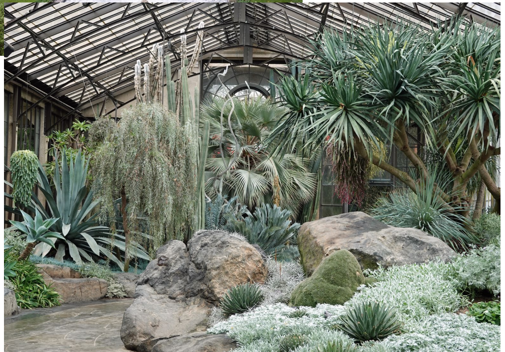
The Silver Conservatory at Longwood Gardens

So, as you can see, I'm a bit of a history and trivia buff. The out of the way places are always the most fascinating places to visit.