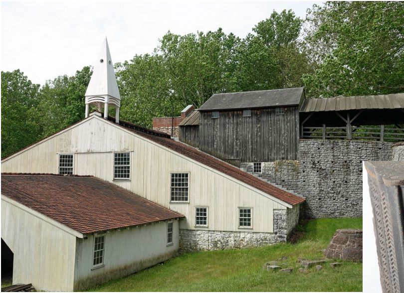
Hopewell Furnace, Ironmaking Complex

Hopewell and other "iron plantations" laid the foundation for the transformation of the United States into an industrial giant for the time. The park's 848 acres and historic structures illustrate the business, technology and lifestyle of our growing nation."