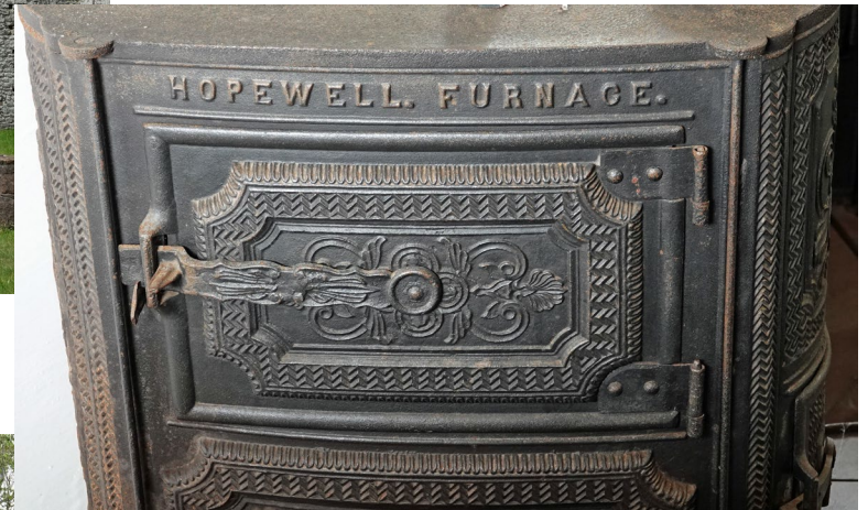
A Stove Plate