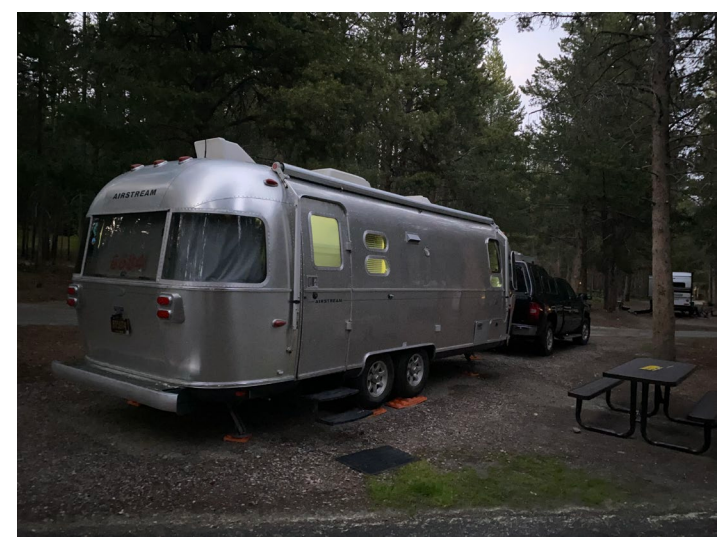
Campground at Coulter Bay RV Park, Grand Teton National Park

WBBCI: Wally Byam Caravan Club International Inc.