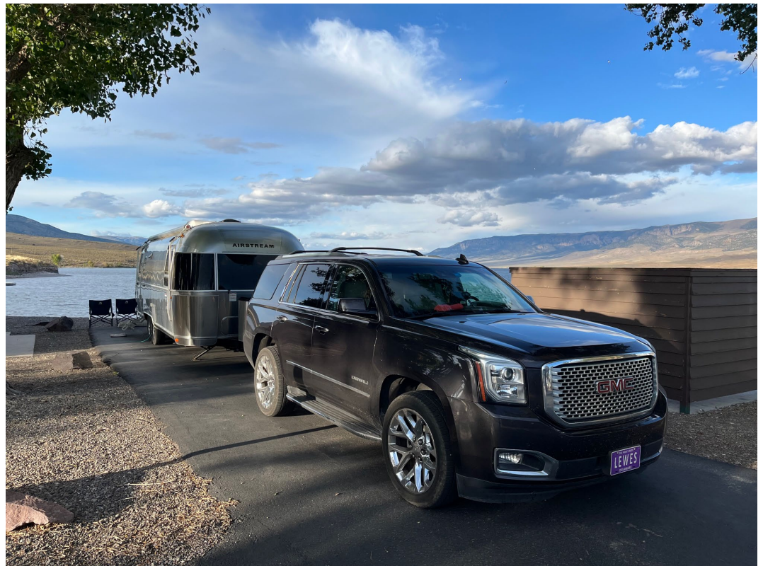
Campsite at Otter Creek State Park, UT

I was surprised to learn that people often skip Bryce as it is quite isolated, but in my opinion, it is the most colorful and inspiring of the five national parks that we visited.