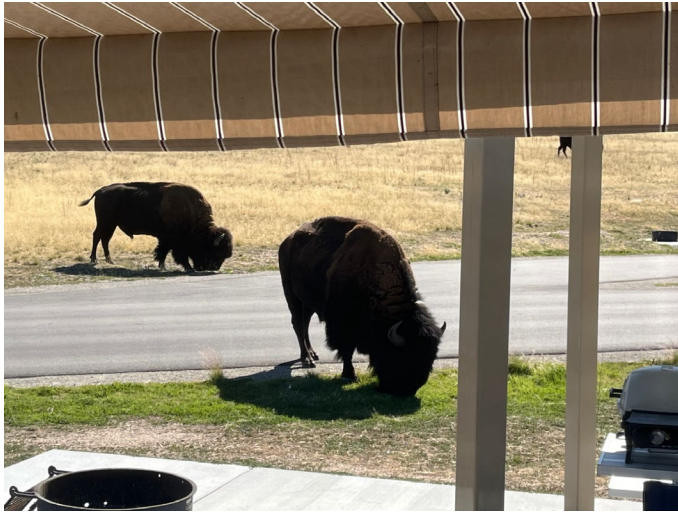
The Bison Visiting Our Campsite

The next stop was the KOA Journey in Rawlins, WY. From Rawlins, we continued west on I80 onto I84 through Ogden, UT to Antelope Island State Park, our first Utah destination. Antelope Island is a great state park, the island is connected to the mainland by a seven-mile causeway through the Great Salt Lake.