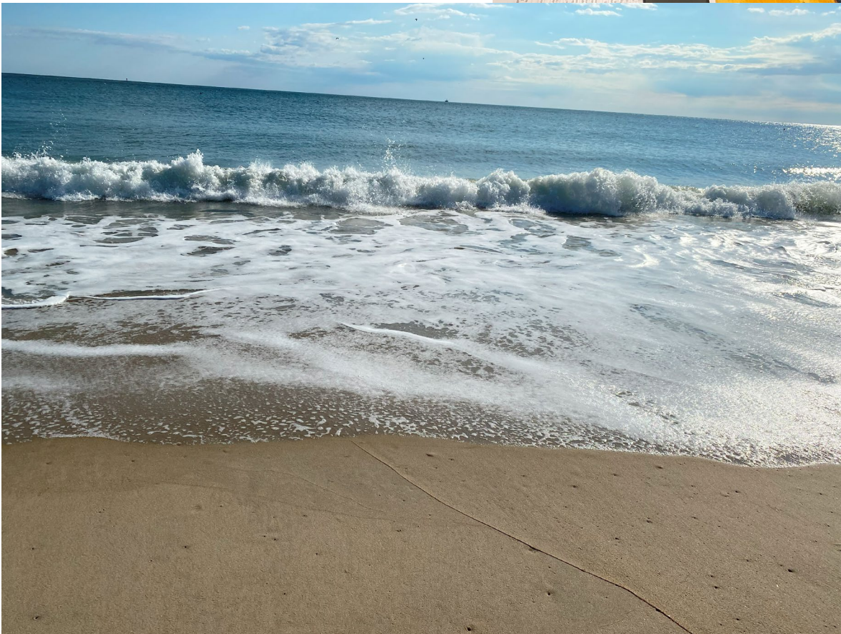
Weather Sunday morning dawned clear, allowing a last look at the ocean and inlet.