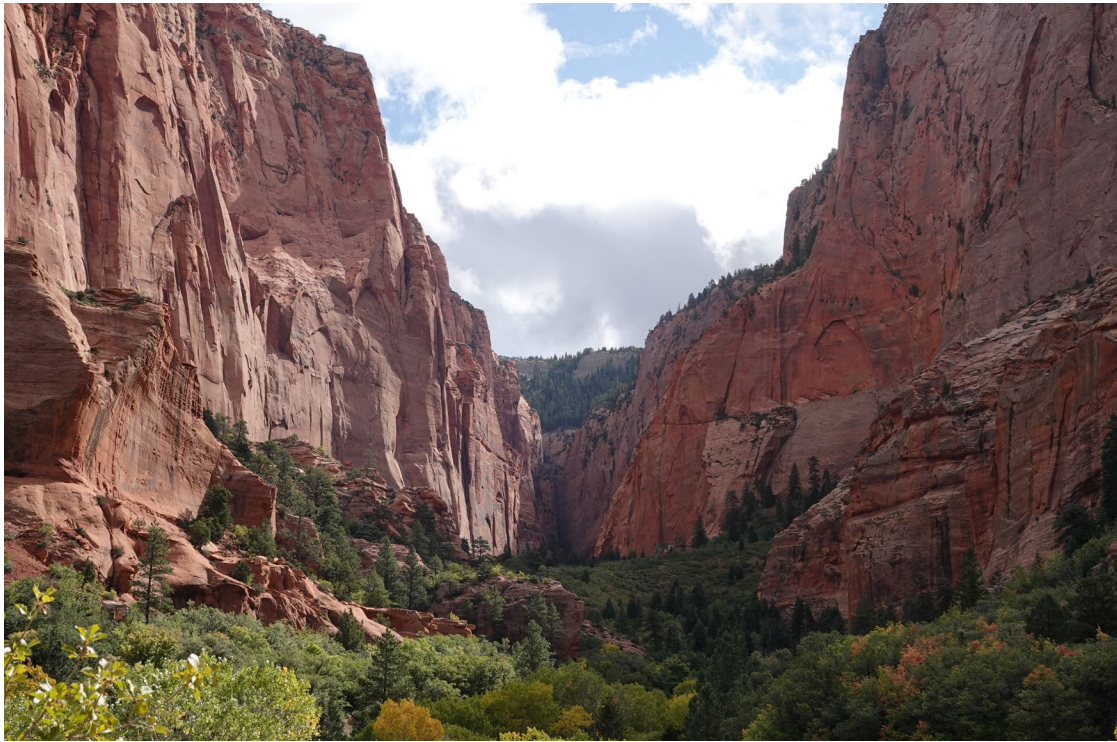
Kolob Canyon, Zion National Park

We also drove into the Kolob Canyon section of the park and up the Kolob Terrace Road to the reservoir, where there were stunning views along the way and at the top. The Kolob section of the park is less visited and well worth the trip.