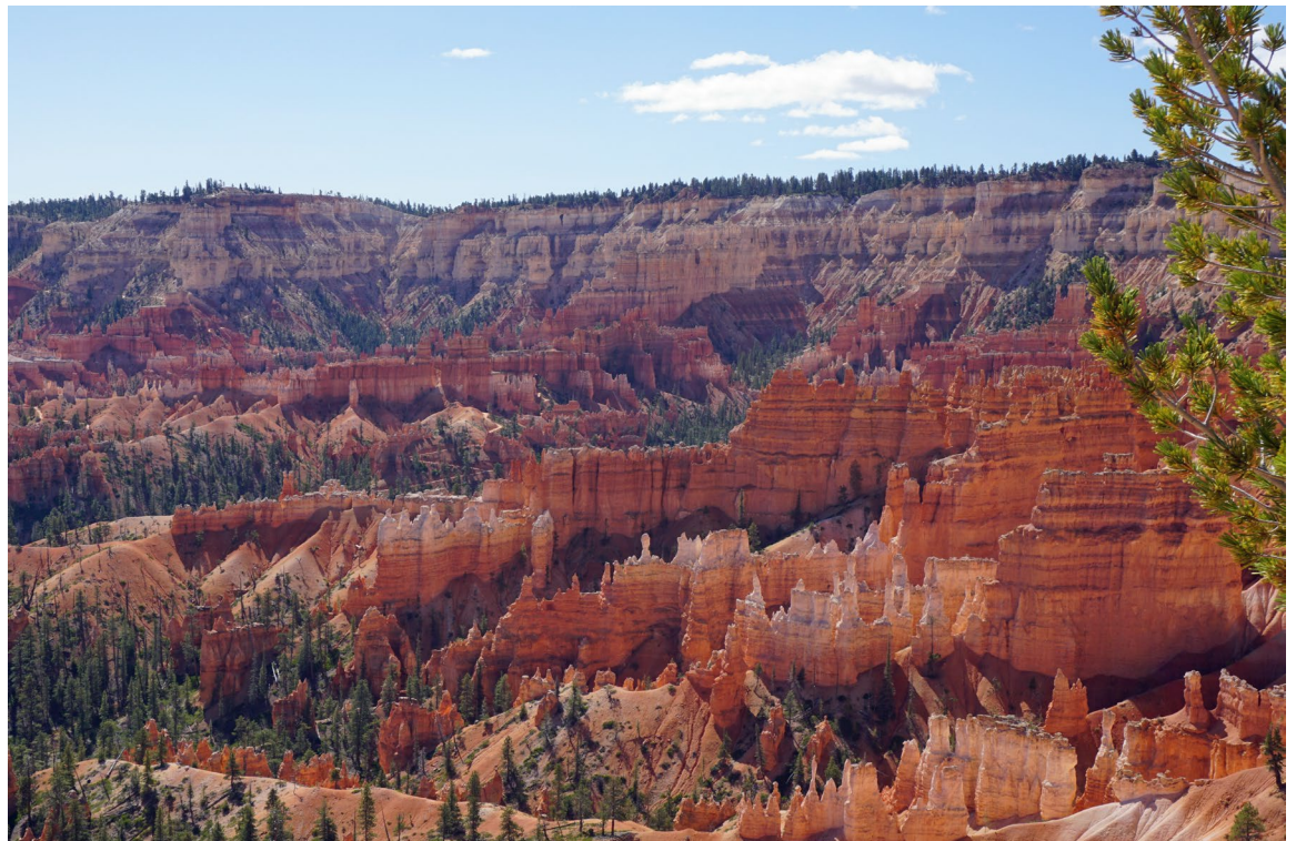
View from the Rim Trail, Bryce Canyon National Park