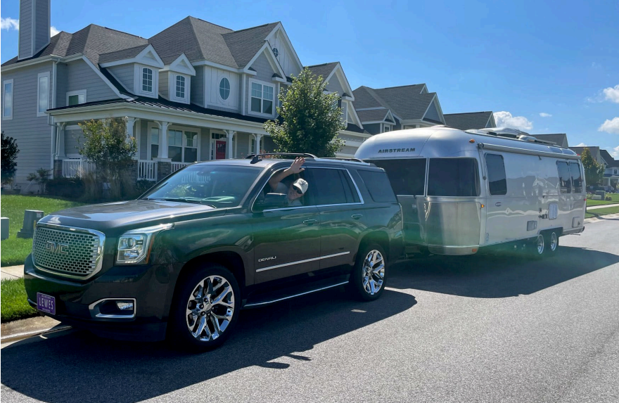
Ready to Hit the Road - The Beast pulling Bella

We planned out a 30-day trip with the objective of going west of the Rockies with Bella, our 2017 27' International Serenity FBQ.