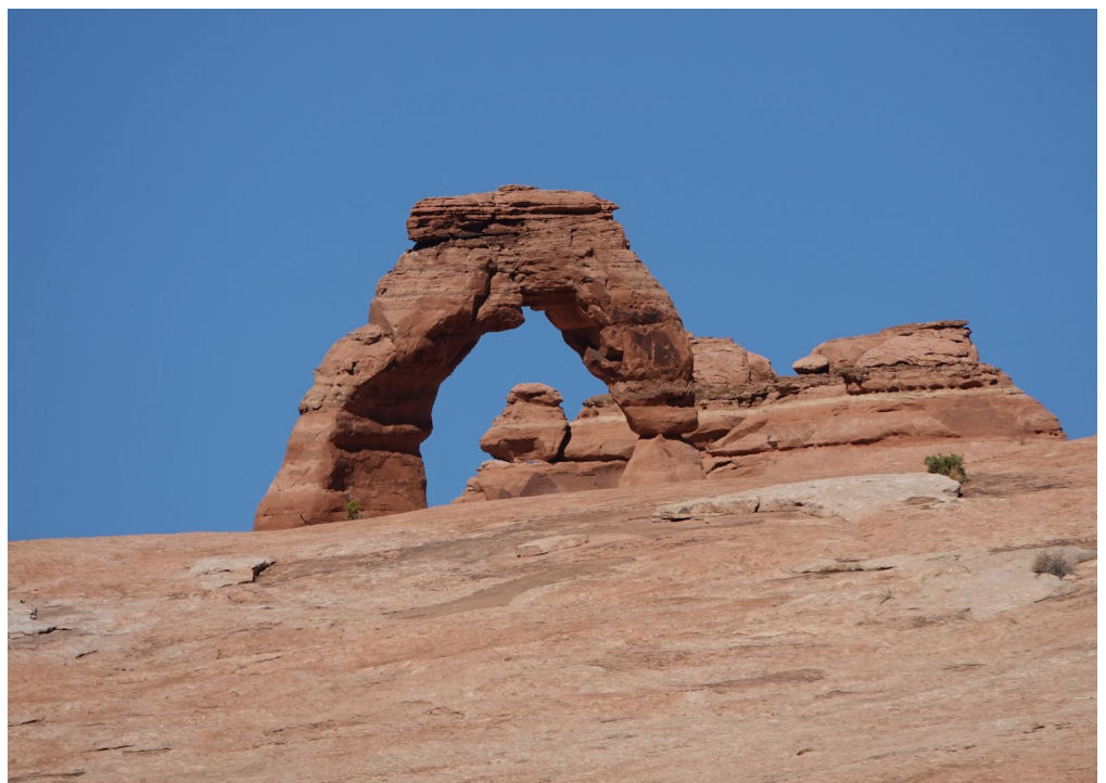
Delicate Arch, Arches National Park