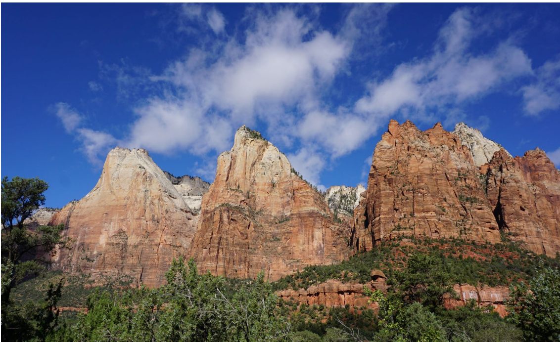
Court of the Patriarchs, Zion National Park

From Antelope Island we headed south for Apple Valley, UT and the Range RV Campground - the base for our visit to Zion National Park. While it is a commercial campground, it was very nice and just happened to be hosting a FROG (Forest River Owners Group) Caravan. The FROGs were nice folks and very well organized.