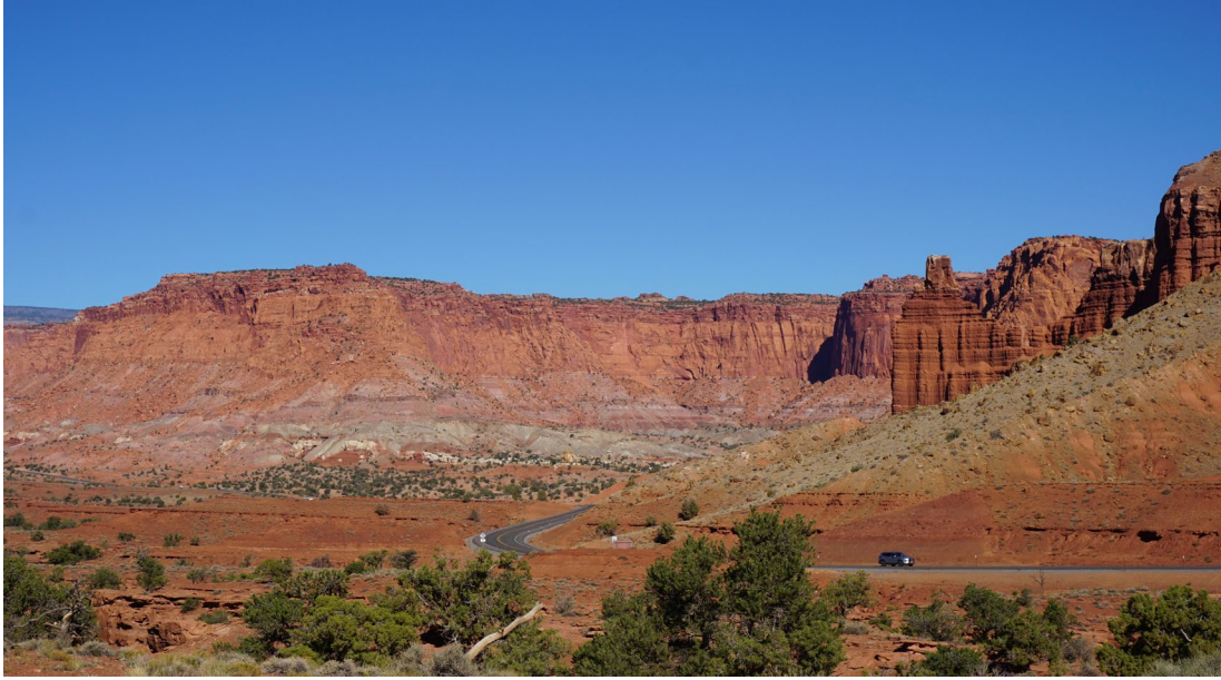
View Along State Route 24, Capitol Reef National Park

After our time at Otter Creek, we headed for Moab, UT passing through Capitol Reef National Park on the way via State Route 24.