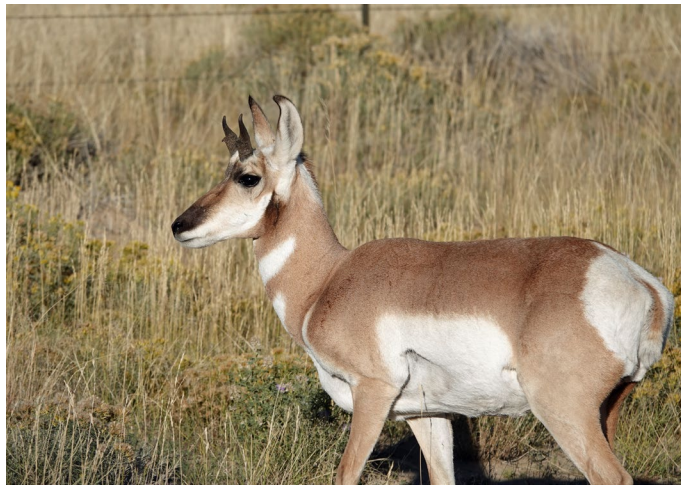
Roadside Antelope, See the Great Utah Adventure, Page 11

WBBCI: Wally Byam Caravan Club International Inc.