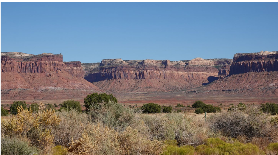
View of the Buttes, Canyonlands National Park

We ended the day at the Sun Outdoors Arches Gateway Campground in Moab. The campground is only about two miles from the entrance to Arches National Park and approximately 30 miles from the Islands in the Sky District of Canyonlands National Park. The campground was cramped and expensive, but the location was good.