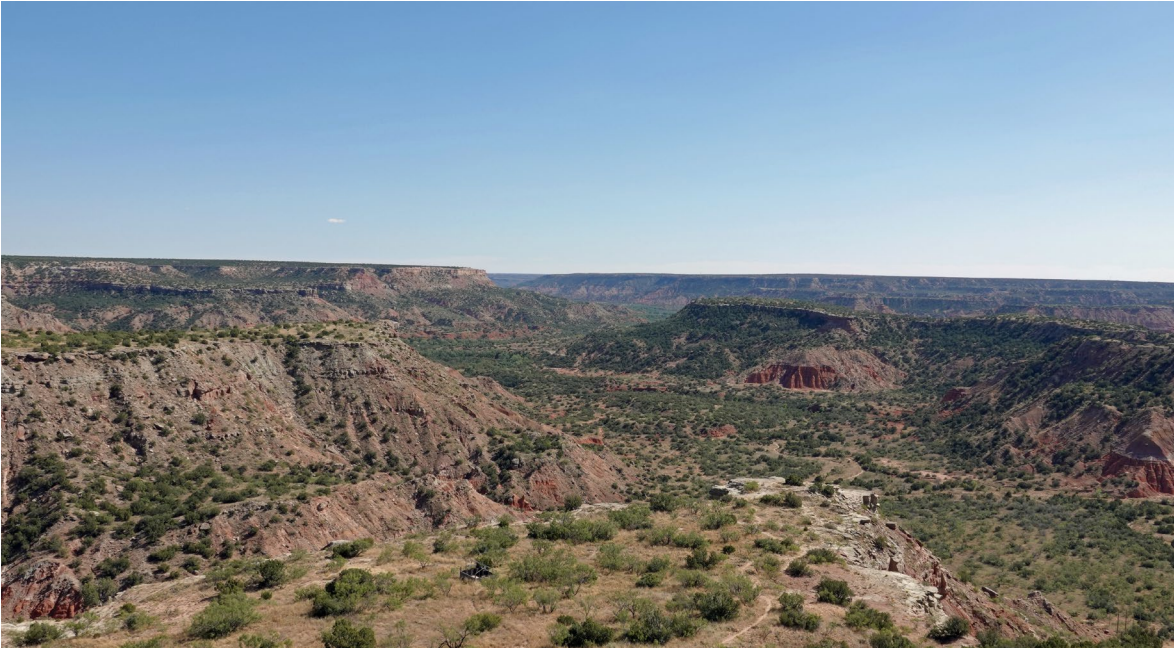
Palo Duro Canyon, Palo Duro Canyon State Park, TX

After ending the Utah portion of our trip, we went south to a KOA Journey Campground in Grants, NM. Nothing special other than a level site, a good laundry, and a free pancake breakfast. From Grants we headed east on I40 to Palo Duro Canyon State Park, the Grand Canyon of Texas, just south of Amarillo. We were intrigued since that area of Texas is extremely flat.