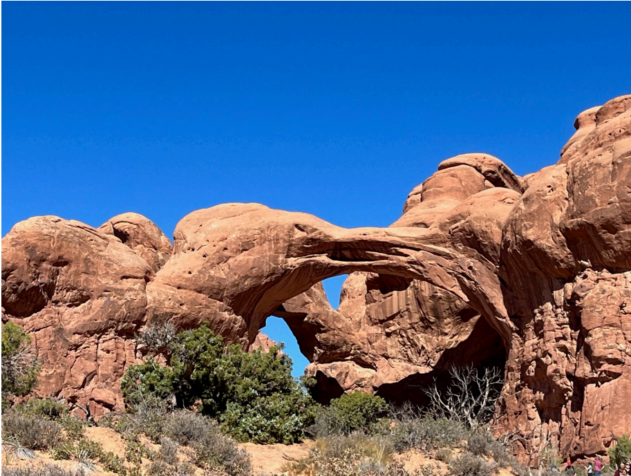
Double Arch, Arches National Park

The next day we headed to Arches National Park at our designated entry time. Timed passes are required at Arches and need to be reserved far in advance. September through November is a very busy time at Arches because the temperatures are less brutal than the summer months. We wound our way through Arches on the scenic drive, making many viewing and short hike stops. Though the Park Service limits access, parking at the various sites is problematic. Without the timed access system, the park experience would be poor.