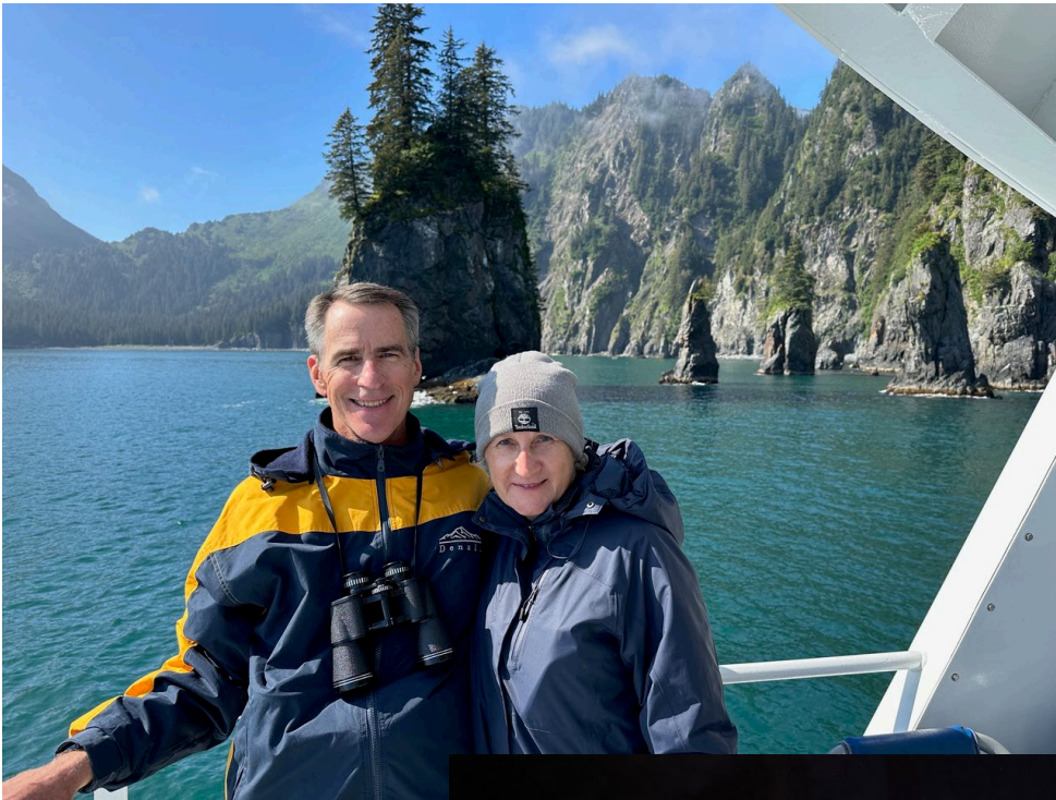
Great Cruising Weather near Seward, AK

hiking, flightseeing around Denali from Talkeetna, and on the nature cruise in Seward. Those events worked out just as we had hoped.