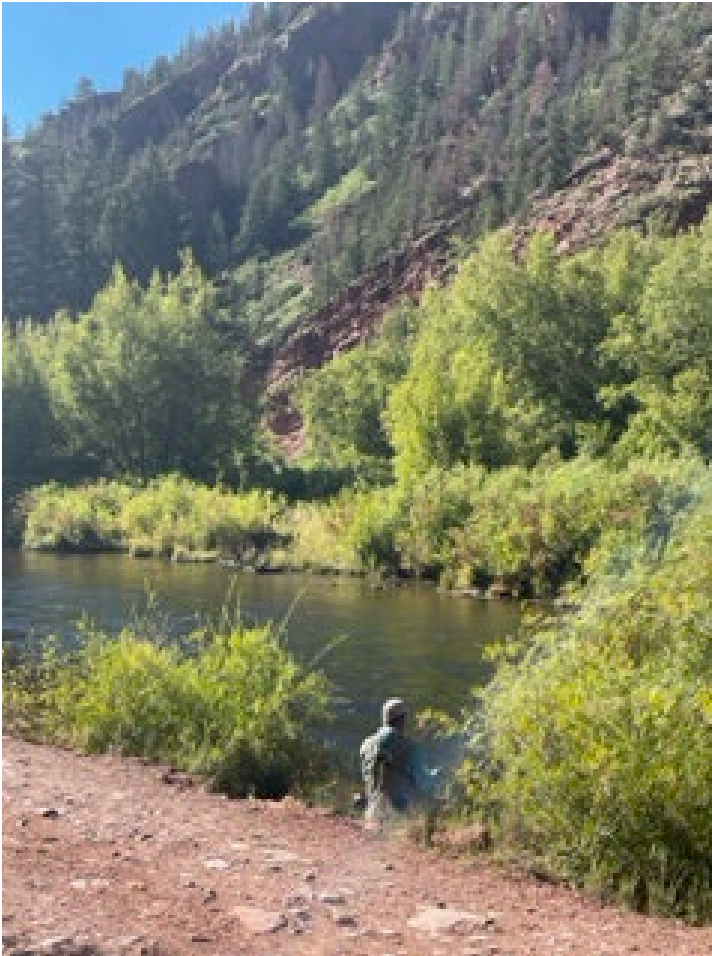
Dave Fishing the FryingPan River

Our next stop was Glenwood Springs West/Colorado River KOA (5,761 ft elevation) where we camped on the Colorado River. We traveled to Basalt CO and the FryingPan River, another gold medal trout stream.