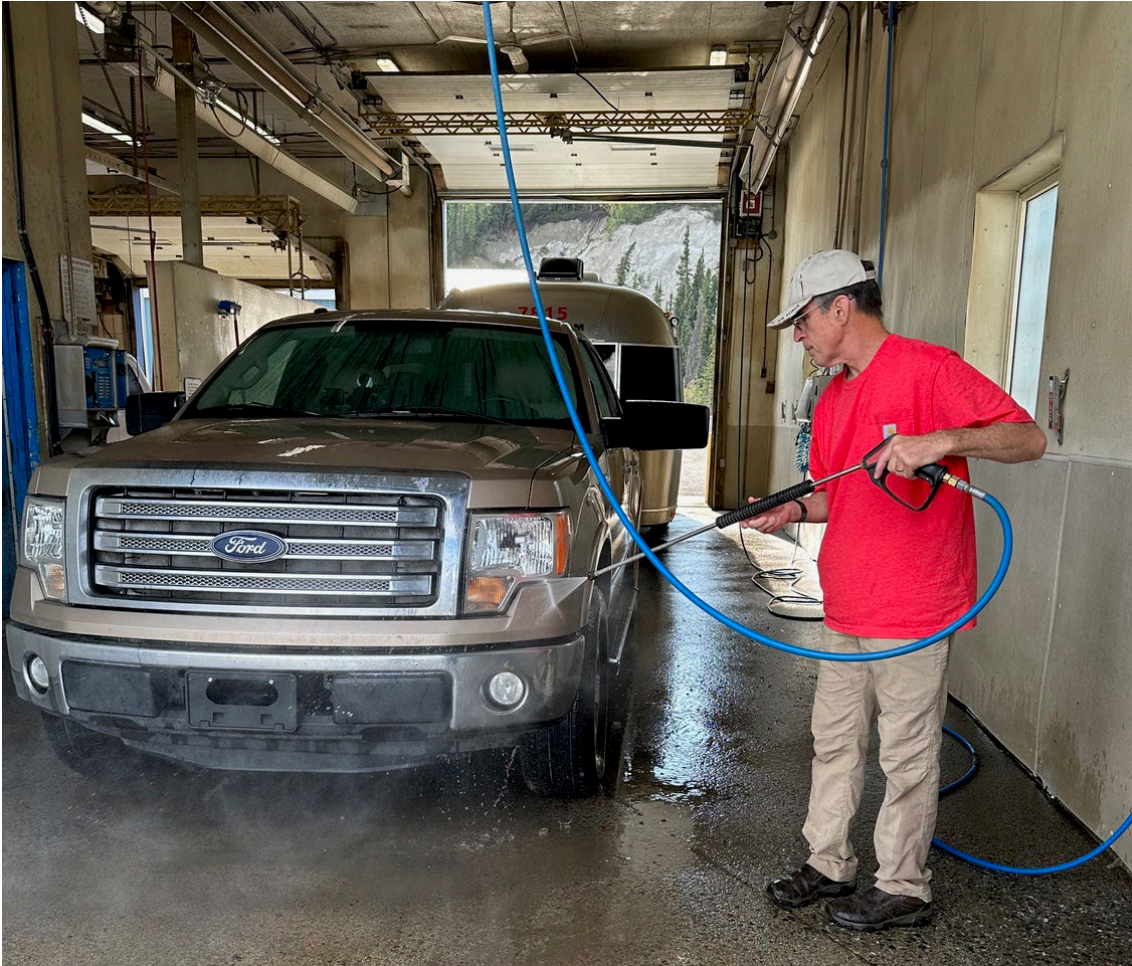
Launch Vehicle and Escape Pod Get a Needed Bath