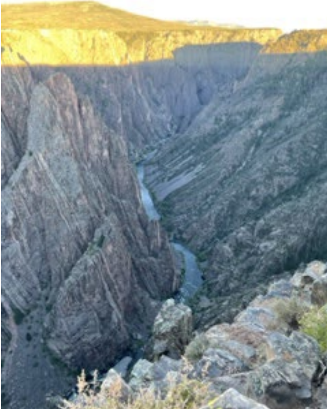
Black Canyon of the Gunnison

John Martin Reservoir State Park Campground was our first stop in Hasty Colorado (southeast CO off of US 50 - elevation 3898 ft). Our site was a handicap site adjacent to the bathhouse and laundry. On our way to Black Canyon of the Gunnison National Park, we climbed Monarch Pass (elevation 11,312 ft), ate lunch at Monarch Pass, and drove on a dirt road where US 50 was under construction. Our campsite at the south rim of the Black Canyon was at 8,000 ft elevation.