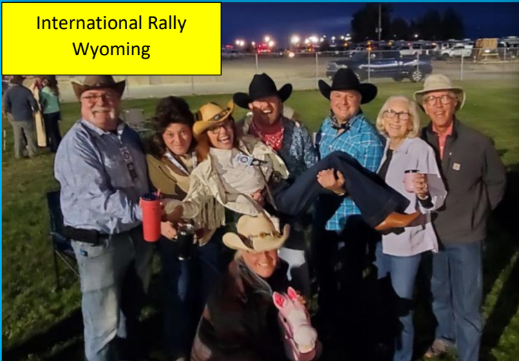
International Rally Wyoming