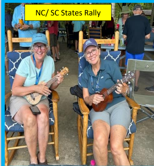
NC/ SC States Rally