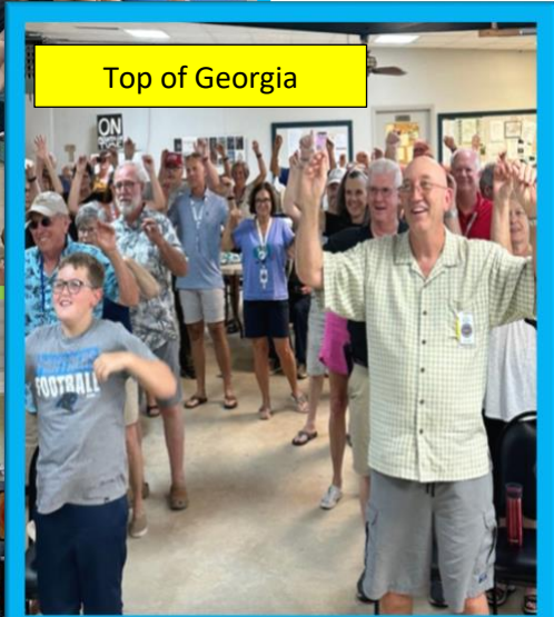
Top of Georgia