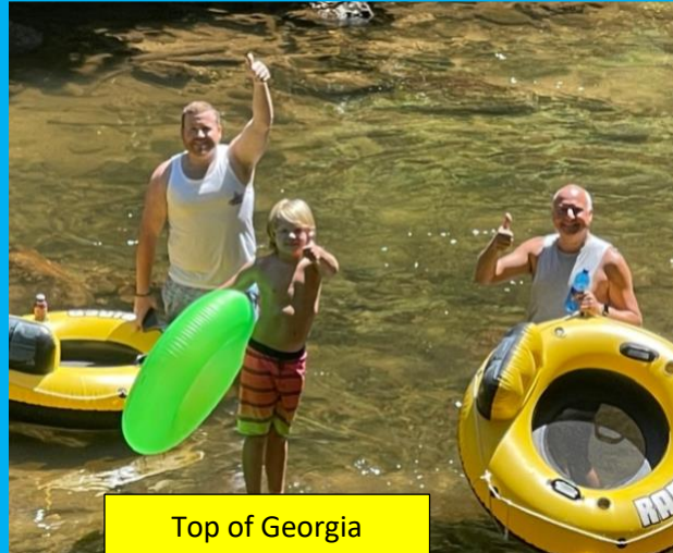
Top of Georgia