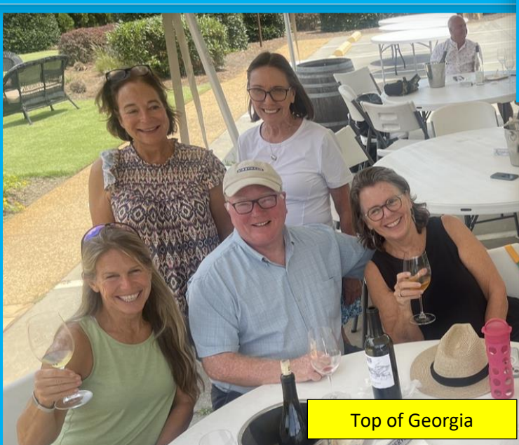
Top of Georgia