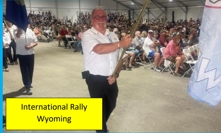
International Rally Wyoming