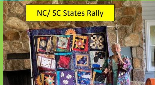
NC/ SC States Rally