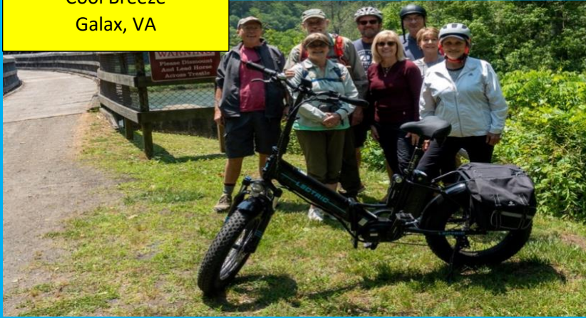
Cool Breeze Galax, VA