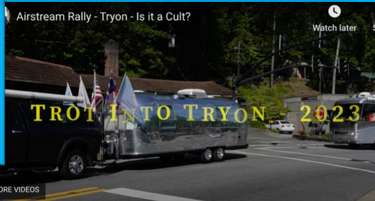
Airstream Rally - Tryon - Is it a Cult?