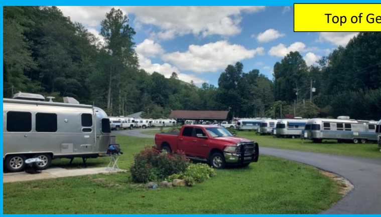
Top of Georgia