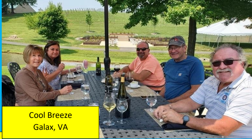
Cool Breeze Galax, VA