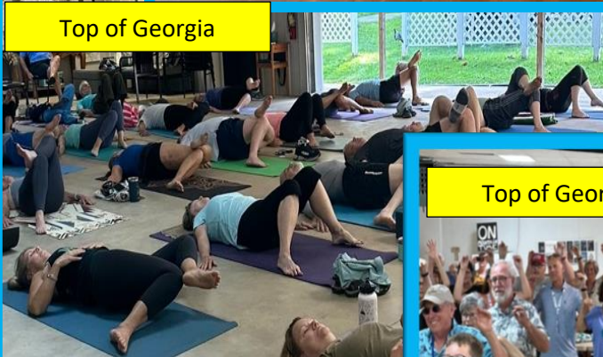
Top of Georgia