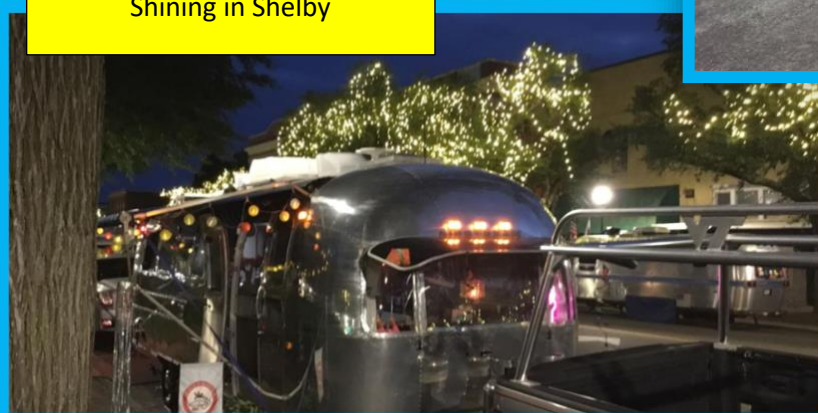
Shining in Shelby