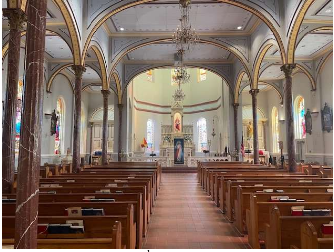
Beautiful church on 2<sup>nd</sup> St