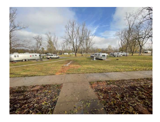
Grand Ecore RV Resort