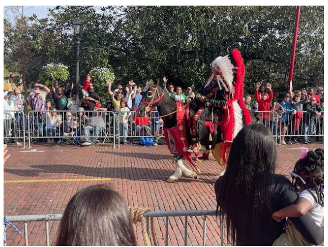
Chief of Butte Tribe of Bayou Bourbeaux