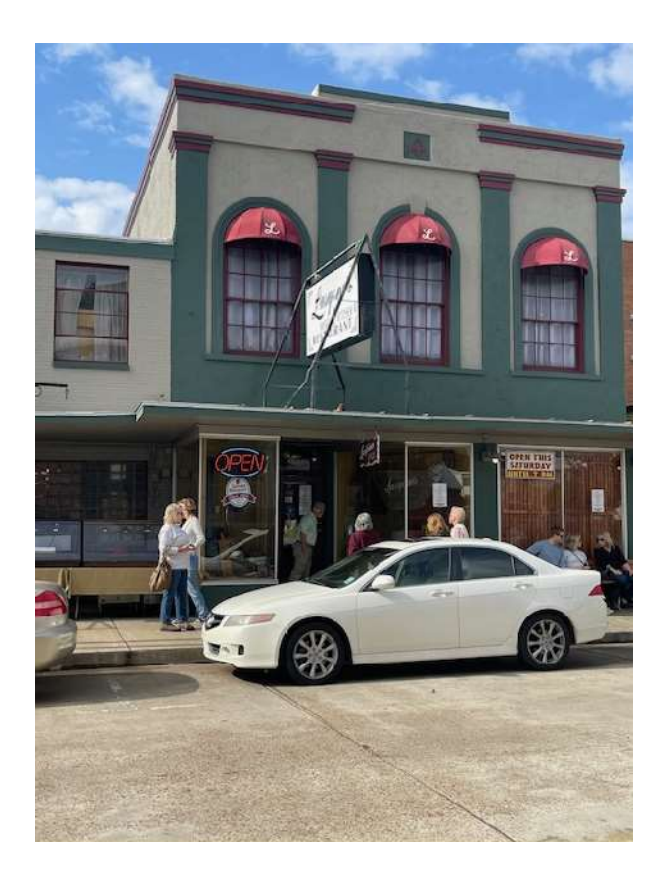
Lasyone's Meat Pie Restaurant on 2^{nd} St