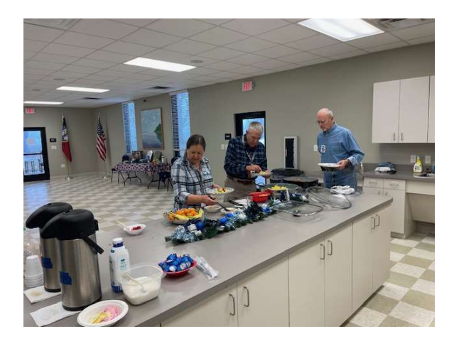
Breakfast is served!