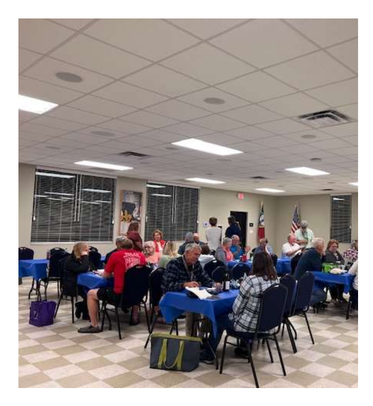
Community Room crowd patiently waiting on dinner!