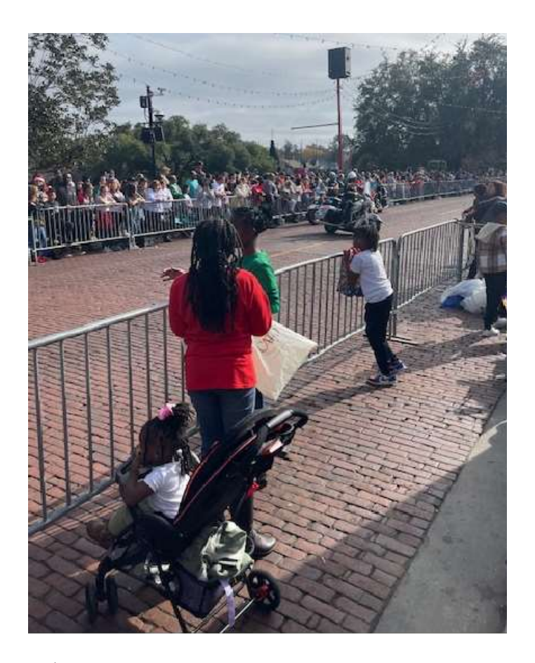
97<sup>th</sup> Natchitoches Christmas Festival Parade starts with police motorcycles.