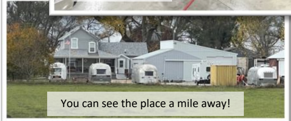
You can see the place a mile away!