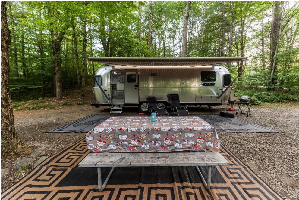
Campsite at Mt. Greylock Campsite Park.