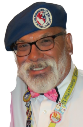
President Rich Espinosa

People ask why do we display our big red numbers? If you attend a large Airstream rally such as a region or international rally, there will be one hundred to more than 1,000 of the silver beauties. They all look alike unless you're an Argosy. BRNs are like addresses on buildings. They are used to identify rigs and their occupants. That's not so important at our local rallies but it is when it comes to the larger ones. At the International rally, Airstream has a geoaccess map that allows you to find your friends or, in cases of emergency, allows paramedics to locate persons needing aid. Not all BRNs need to be permanently affixed, which could leave ghosting of the numbers on the rig if removed. There are many options to display your BRNs while attending rallies. You can Google ideas for displaying BRNs to get ideas. Let's be proud of our rigs and the Airstream community, and display our BRNs when attending Airstream rallies.