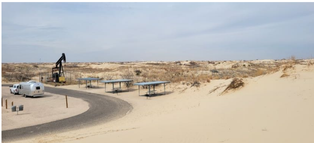
Monahans State Park

March is the time I bring the camper out of a winter's slumber and get it on the road. I hit a few State Parks on my way to spring baseball in Phoenix. San Angelo State Park had a fun mountain bike trail, and a lake that was only 3% full. Wow! Monahans State Park was a good place for a lunch break. Franklin Mountains State Park and the nearby BLM property offered some good mountain biking.