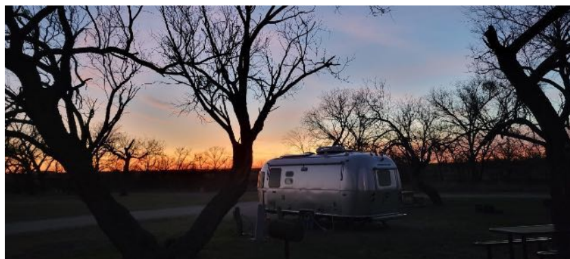
San Angelo State Park