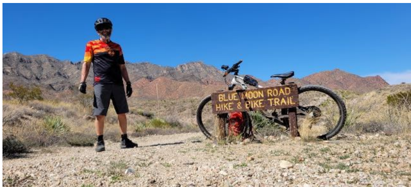
Mountains State Park and the nearby BLM property offered some good mountain biking.