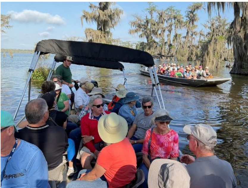
Swamp tour in Breaux Bridge