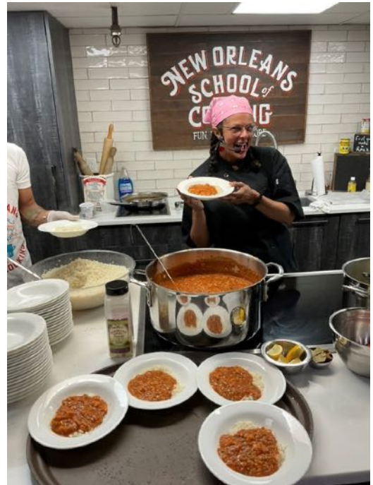
Cooking demonstration with lunch at New Orleans School of Cooking