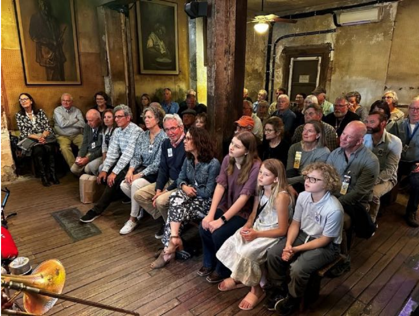
Private performance at Preservation Hall in New Orleans.

After each caravan we request and receive suggestions and it just keeps getting better every year.