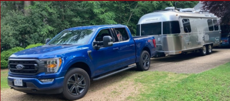
"Big Blue" and Ginger