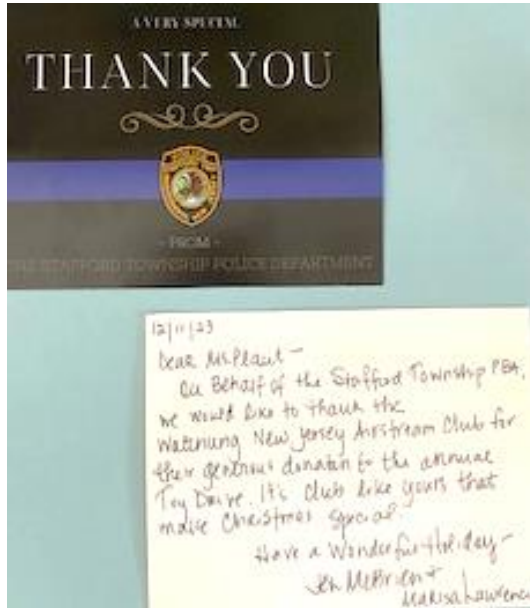
Thank you note from the Stafford Township PBA for the club's Christmas toy donation.