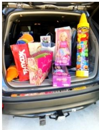
Trunkful of toys collected at the installation luncheon.