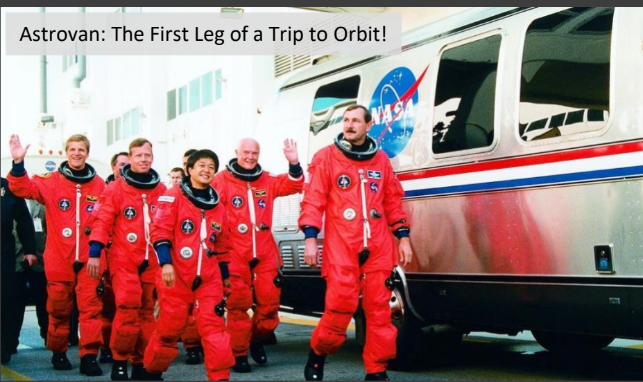
Space Shuttle Discovery Crew