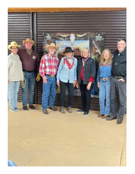
This is how we do Western Wear