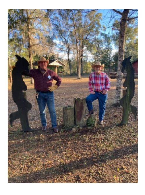
Two Old Cowboys

Facebook page info sharing - I would love it if you would post one or two of your Airstream/Camping photos on our Club Facebook page. All of our Region 6 leadership are members of every Region 6 Airstream Club's Facebook page and several other Region 6 Club members have access to our page too. All region 6 Facebook pages are available to you and listed later in this newsletter. Contact me if you have issues accessing our page. If you are interested in posting, sign into Facebook and go here: Facebook "Pensacola Airstream Club 29" or https://m.facebook.com/groups/ 689634279426048/? ref=share&mibextid=I6gGtw