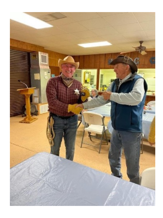
Who's the real Sheriff??