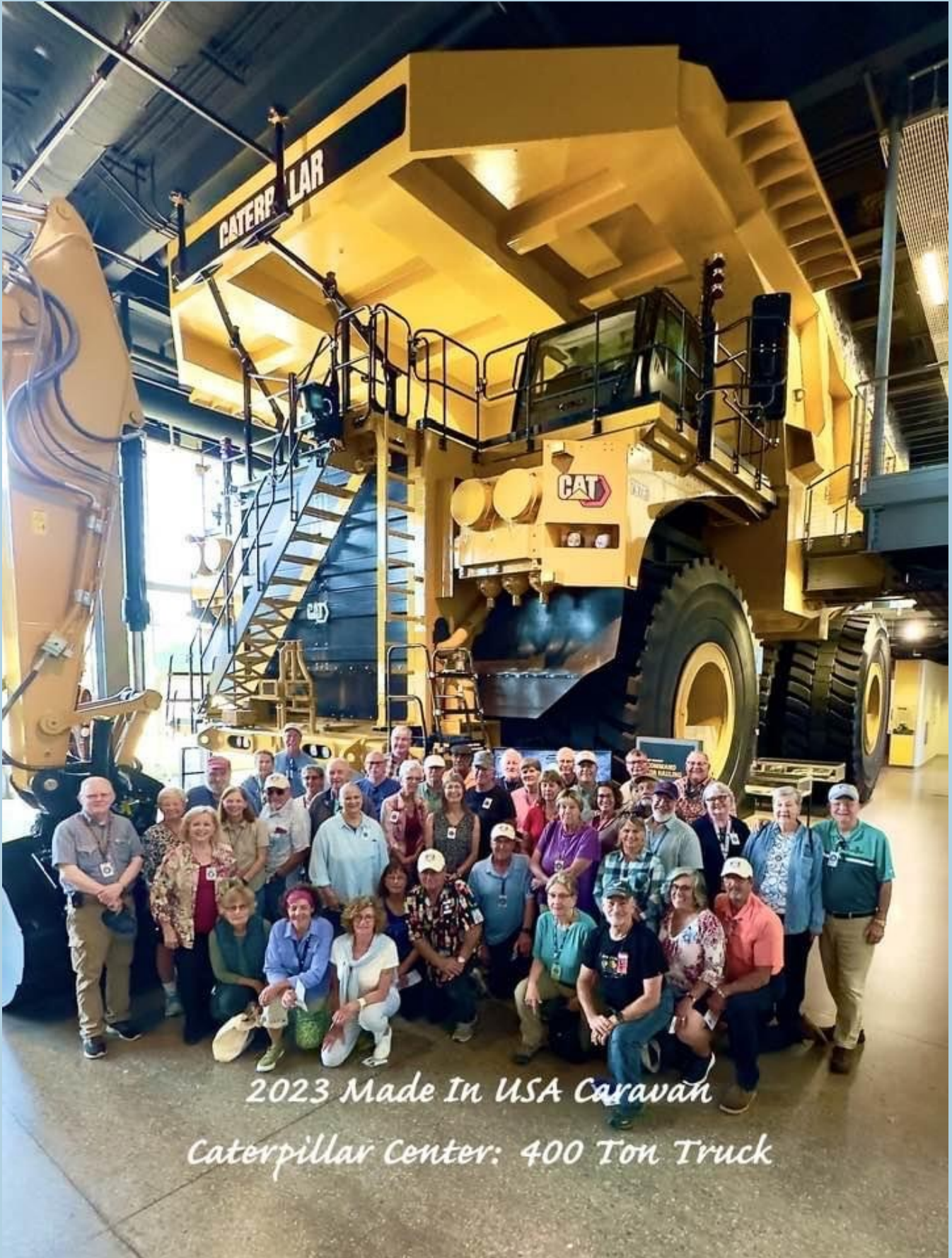
2023 Made In USA Caravan Caterpillar Center: 400 Ton Truck