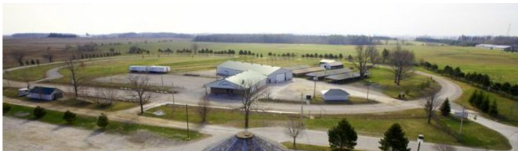
Seaforth Agricultural Fairgrounds in need of some Airstreams