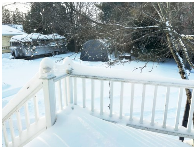
Jacklin and Tony under the snow

I write from our cozy old house in Northern Ontario! Yes, we stuck to our plan and stayed in the northern climes! So my photo for this entry is snow....we finally have some! And we have just had a week of some low temperatures with the lowest being -21^{\circ}\text{C} ; today we feel like we are back in the warmth at -1^{\circ}\text{C} . We had family here for the Christmas holiday and what did the ground look like? Green! Flowing water in the Thessalon River. And our first artificial tree...ever! (noted by grandchildren)