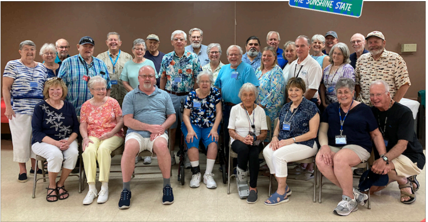
Connecticut members and guests sharing the annual Souper Bowl Sunday.