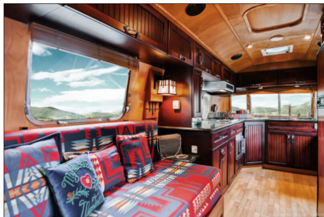
Take a look at this unique Stardust Airstream.