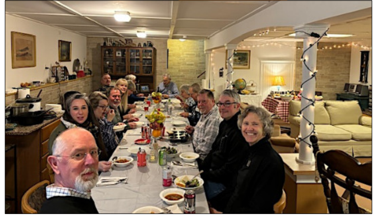
Everyone enjoying a souper lunch!

See you down the road! Next stop, the Rousseau's on March 17!