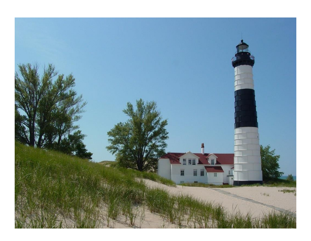
Big Sable Lighthouse, Lake Michigan, Lighthouse image. Free for use.