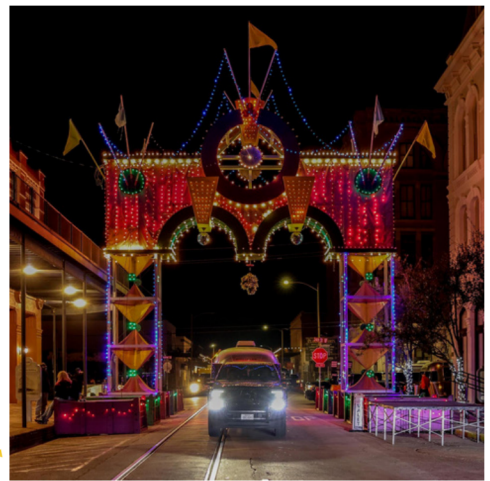
Last Airstream to be parked on Thursday