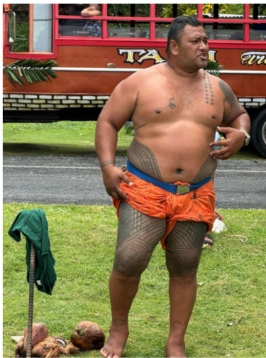
Clan Chief in American Samoa