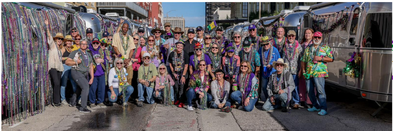
All Airstream Participants on Saturday afternoon