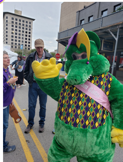
Alligator costume... who could be in there?