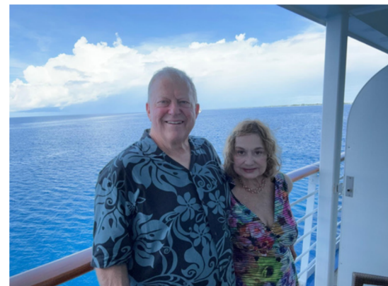
On our veranda in Bora Bora