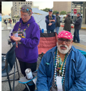
Rich taking a break