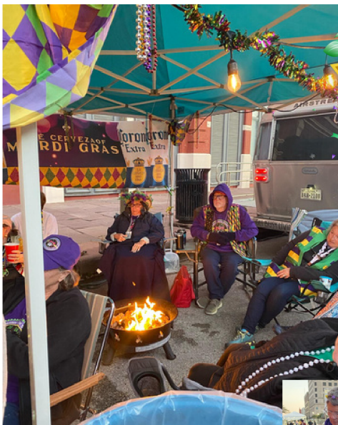
Thursday Night at the hospitality tent