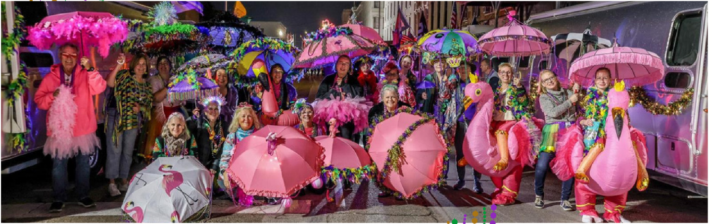
Umbrella Parade on Friday Night