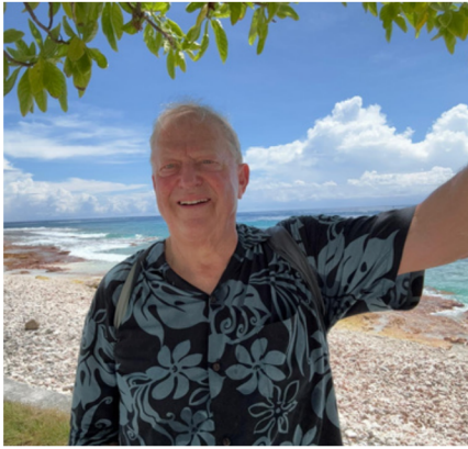
Rangiroa, French Polynesia