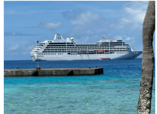
The Insignia in Kona