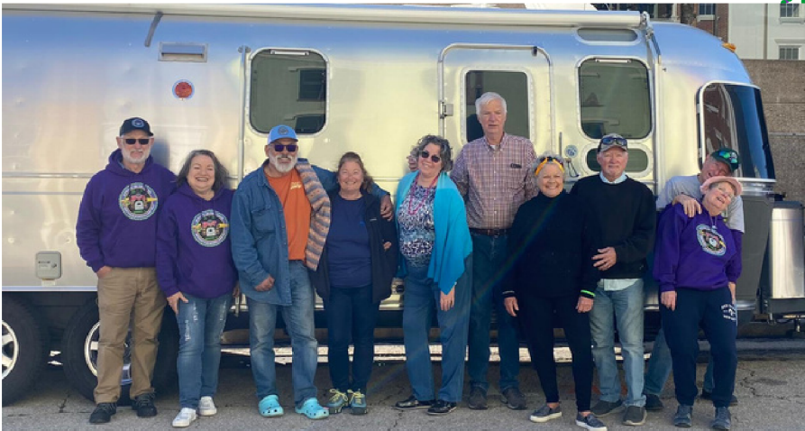
Parking Team is finished!