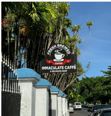
Who can turn down a cup of "Immaculate Coffee"?