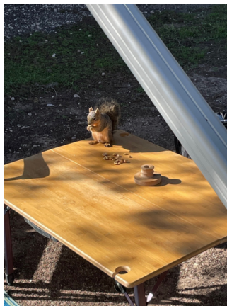
Relaxing time, taking in nature!