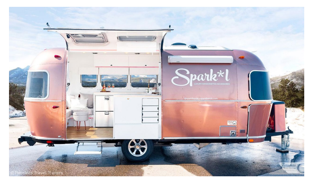
Now That's Imaginative!

WBBCI: Wally Byam Caravan Club International Inc.