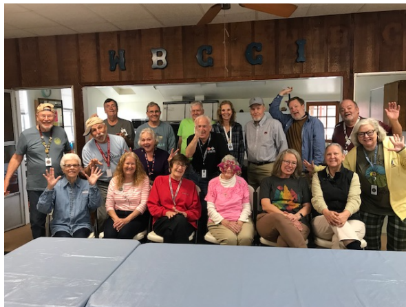
Alabama Club members at Mystic Springs