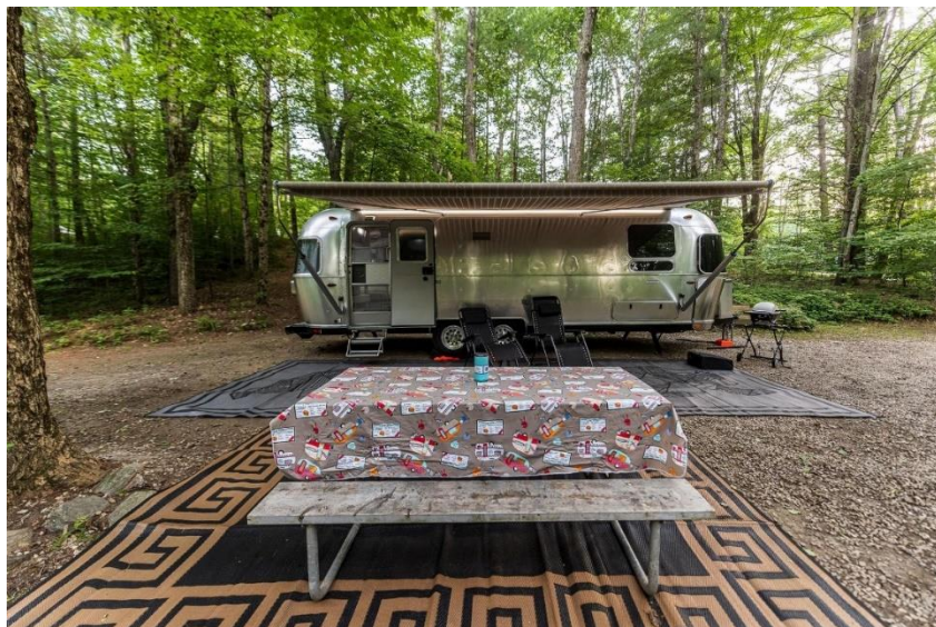
Campsite at Mt. Greylock Campsite Park.