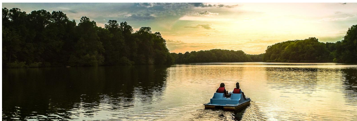
Lums Pond State Park.

The hosts and co-hosts will be arriving a day earlier, September 5, so please feel free to join them.