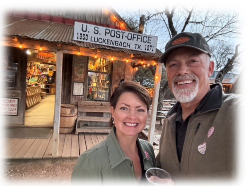
All Hours are Happy Ones.

We've planned the Sip of Texas III in Fredericksburg, for May 22 – 26 which is