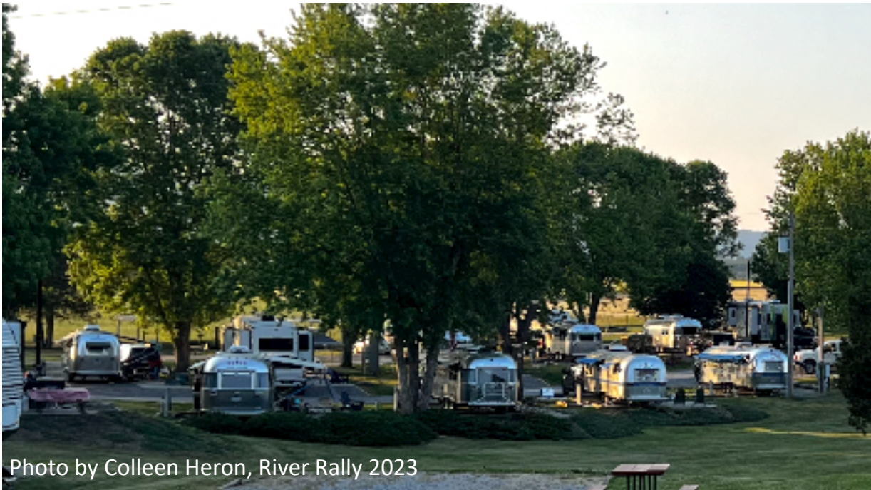
River Rally 2023

Don't forget to sign up for the RIVER RALLY (June 7-9)